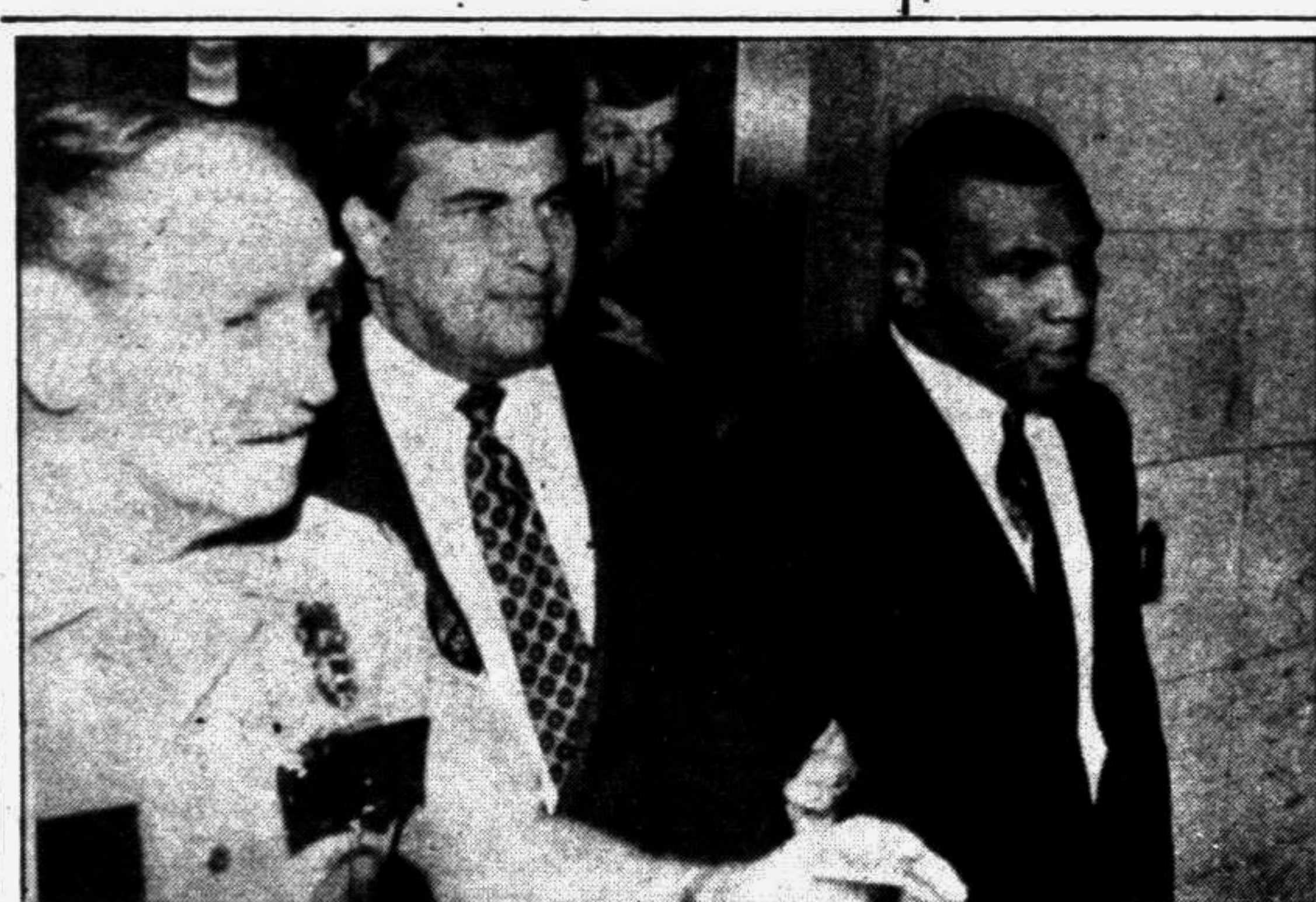
US heavyweight boxer Mike Tyson (R) arrives for a court appearance accompanied by an unidentified defence attorney (C) in Indianapolis, Indiana, on Tuesday (Sept 11) to answer an indictment and be booked on a four felony charges stemming from an alleged rape on July 19.

Tyson was charged with one count of rape, which carries a prison sentence of six to 20 years; two counts of criminal deviate conduct, which carries the same penalty per count; and one count of confinement — unlawful restraint — which carries a sentence of one to three years.