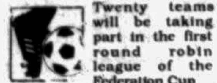
Twenty teams will be taking part in the first round robin league of the Federation Cup football championship scheduled to begin in Dhaka from September 27.

The teams will be divided into four groups, with the top team from each group qualifying for the second phase.