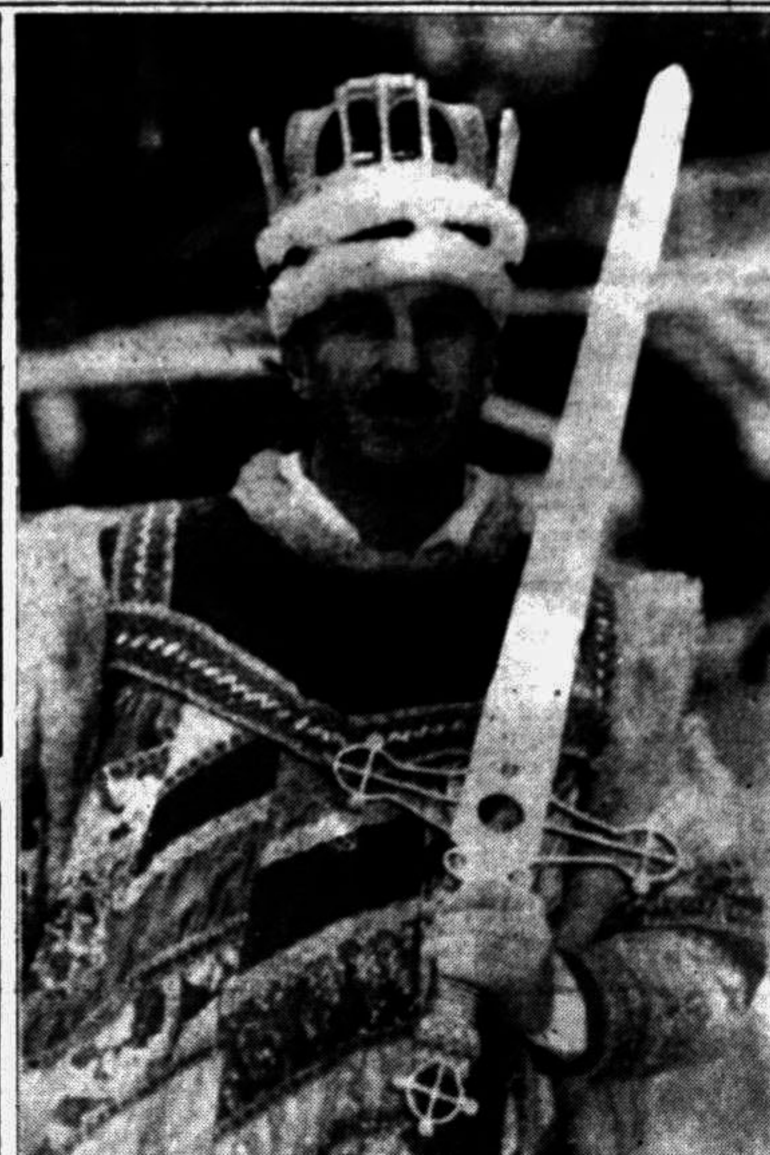
An AFP file photo, dated December 12, 1990, shows England allrounder Ian Botham in his pantomime costume. The Test and County Cricket Board is allowing Botham to arrive three weeks late for the winter tour of New Zealand which will enable him to finish his pantomime season in Bournemouth, England.