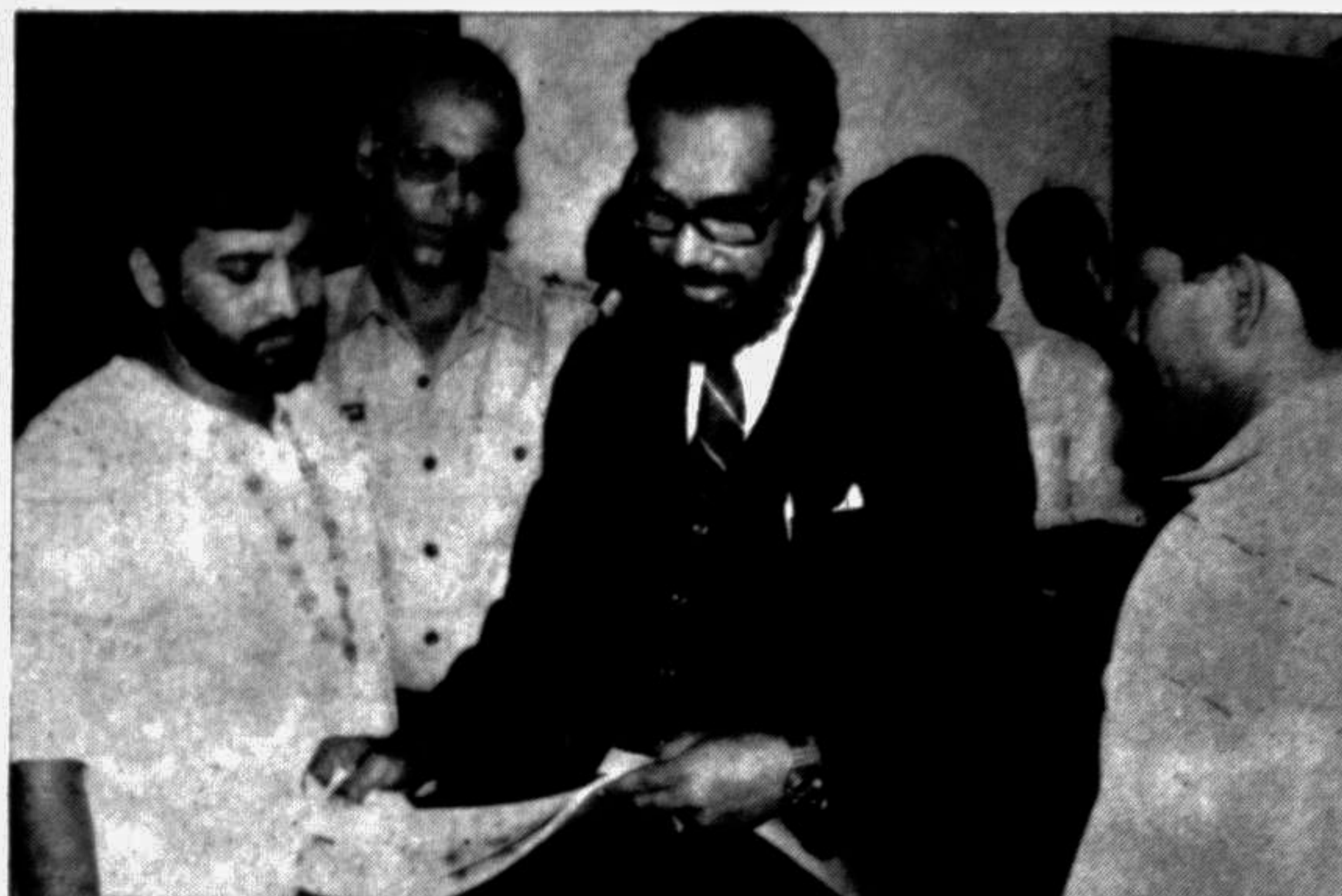
Chief Election Commissioner Justice Mohammad Abdur Rouf visiting a polling centre during by-elections on Wednesday.

Karim is at present Minister and Deputy Chief of Mission in Bangladesh Embassy in Beijing.