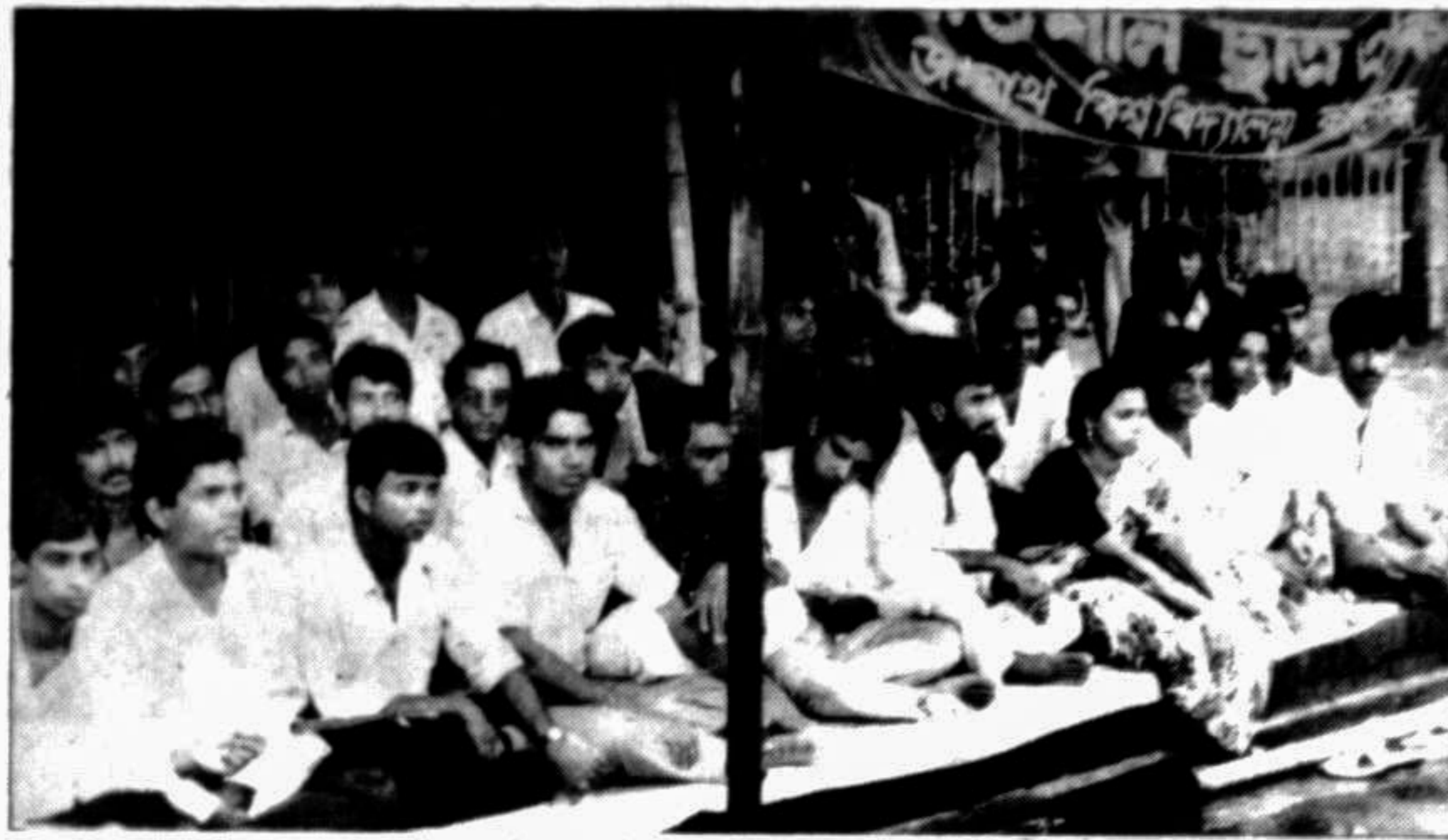
Students of Jagannath college observed token hunger strike Monday in front of the National Press Club demanding reopening of the college.