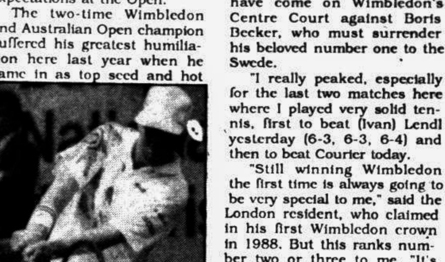
COURIER...outplayed favourite only to crash out in the first rounds.

But at the 1991 Open, Edberg put it all together. His graceful serve-and-volley game, a perfect combination of power and finesse, was firing on all cylinders from his brilliant fourth-round victory over Michael Chang through his demolition of Courier on the final Sunday. "It's really something to actually win it here after what happened last year and the last couple of years where New York hasn't been the greatest place for my tennis." "Actually to turn it around here, it's really hard to describe," Edberg said in the post-match interview, his huge