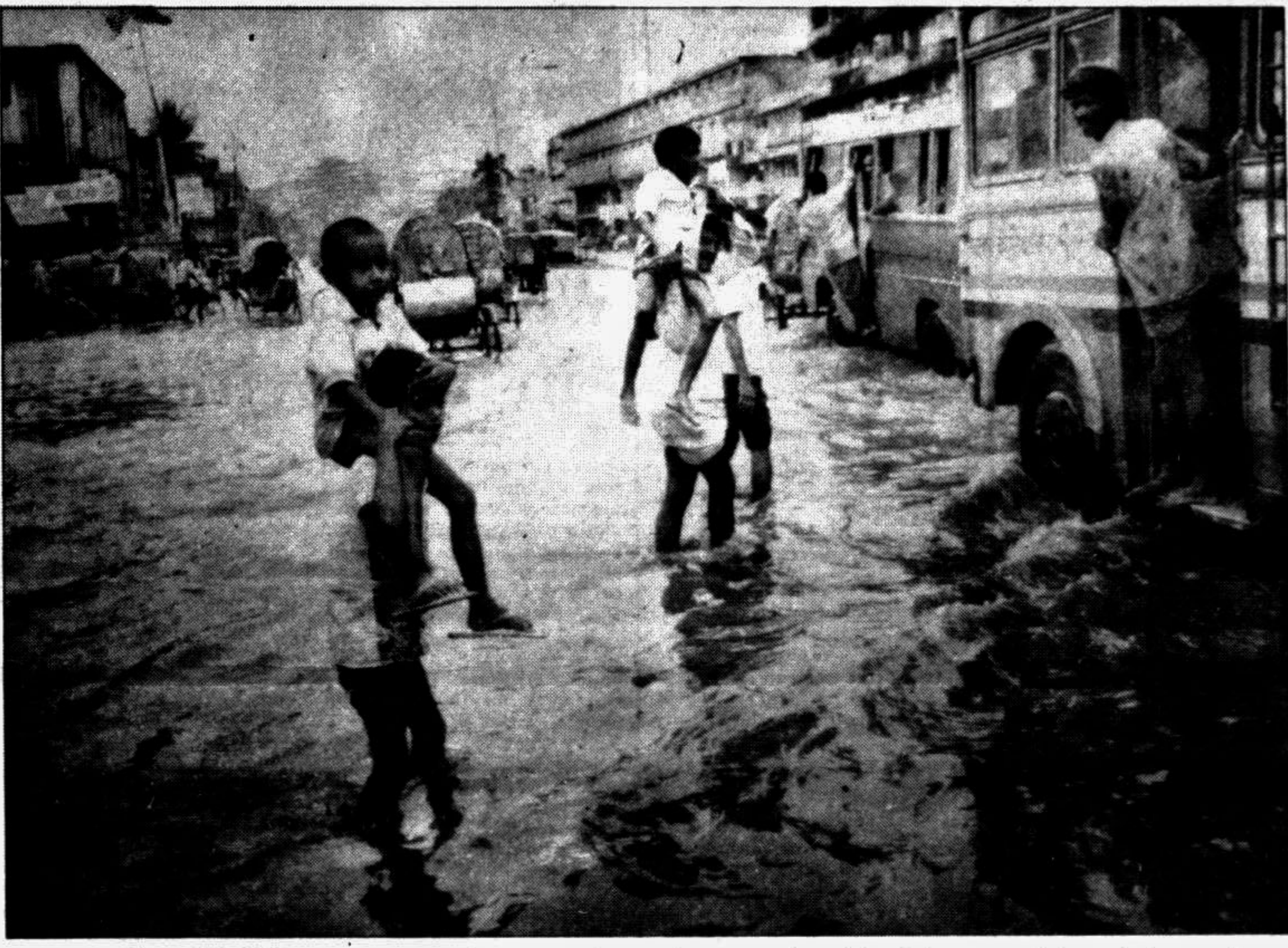
DISRUPTED CITY LIFE: Six-hour heavy downpour submerged many roads and low-lying areas of the capital yesterday. Water remained stagnant in many parts till evening.

Star Report Bangladesh is experiencing a late monsoon flood as all the three major rivers are in spate due to unusually heavy downpour and onrush of water from upper catchment across the border. The situation may worsen in a couple of days, indications say. Vast area in ten districts — Sirajganj, Pabna, Chapainawabganj, Kushtia, Rajshahi, Manikganj, Netrokona, Sylhet, Brahmanbaria and Narayanganj have already been inundated by flood waters. Thousands were marooned in the affected areas while many rendered homeless due to river crossings. Standing crops on a large area were also submerged. Diarrhoea broke out in the affected areas of Pabna and claimed 22 lives. One minor boy was drowned in the flood water in Pabna. Another three deaths were reported from Rajshahi. The Ganges was flowing above danger level at all points Monday while other rivers — the Brahmaputra, the Karotoa, the Mahananda, the Goral, and the Surma have also crossed danger marks. Rivers in the Ganges, Brahmaputra and Meghna basins registered further rise and most of them are close to danger levels. Hydrologists and weather experts apprehend continued deterioration of the situation for the next few days. Flood Forecasting and Warning Division of Water Development