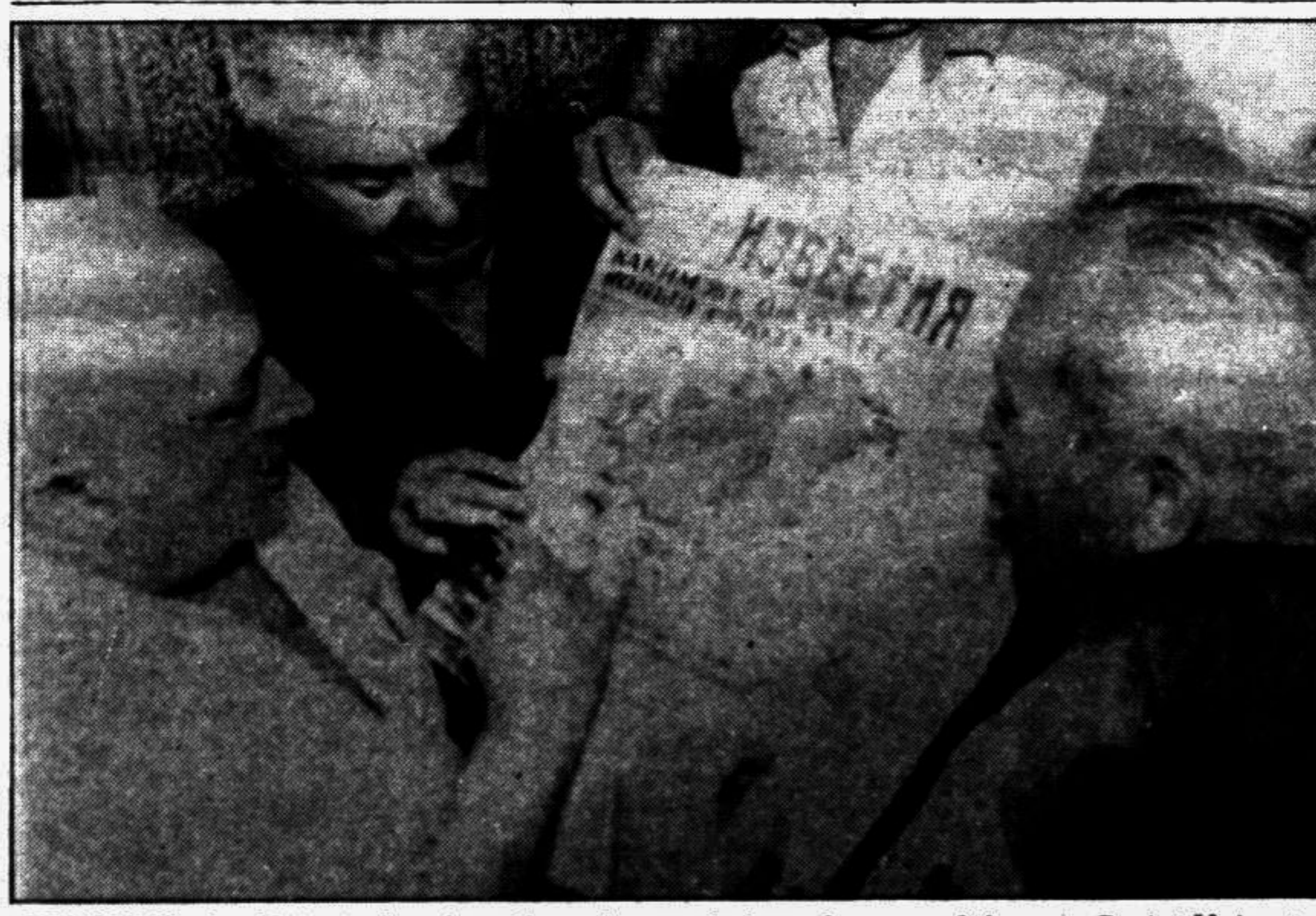
TBLISI (Soviet Union): Local residents have a look at the map of the new Soviet Union to discuss the future of their republic Georgia during a rally Saturday to support their President Zviat Gamsakhurdi who has announced to sever his republic's relationships with the USSR.

ACCRA, Sept 8: The Non-Aligned Movement (NAM) on Saturday called for expansion of the United Nations' elite Security Council to put more power in Third World hands, reports Reuter. A declaration after a four-day NAM foreign ministers' conference in the Ghanaian capital Accra also endorsed political pluralism, giving official weight to the multi party issue for the first time since the movement was founded three decades ago. The present membership of the Security Council should be reviewed with a view to reflecting the increased membership of the United Nations, and promoting more equitable and balance representation of the members of the United Nations," the declaration said. "Reform of the organisation is of cardinal importance to member countries of the movement." The Security Council, which gives permanent status to the United States, China, Britain and France, holds a veto on decisions made by the world body's General Assembly. The call reflected a shift in focus from East-West tensions to the Gulf between the rich North and poor South as the 103-member group strives for a role after the end of the Cold War which inspired it. Diplomatic sources said the move was proposed mainly by major Third World powers like India, Brazil and Indonesia, which hold great regional sway and want a bigger role on the world stage. "They want to be world powers and are very dissatisfied with the UN where they are not permanent members of the Security Council," one source said.