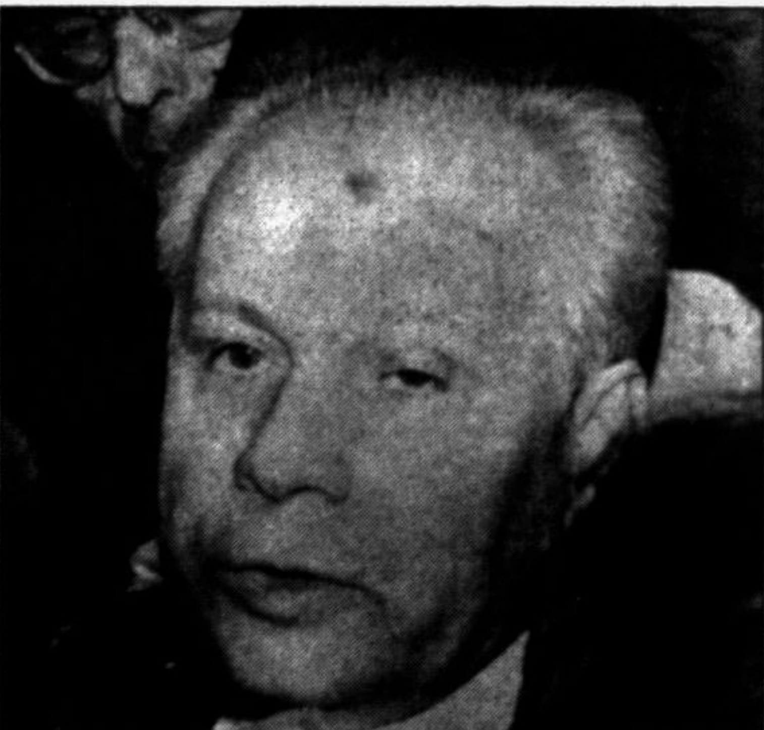
Former Speaker of the Soviet Parliament Anatoly Lukyanov has been charged with treason for failed coup.