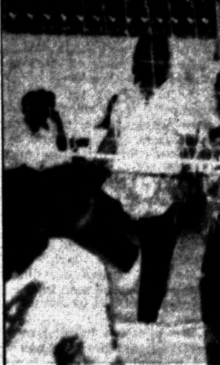
Action from yesterday's Milnars women's volleyball match between Comilla and Pabna at the Dhanmondi Women's Sports Complex.

At Chelmsford, title favourites Essex are on the brink of victory over Derbyshire, one of their chief rivals. The visitors, on 142 for seven in their second innings, are still 170 short of avoiding an innings defeat.