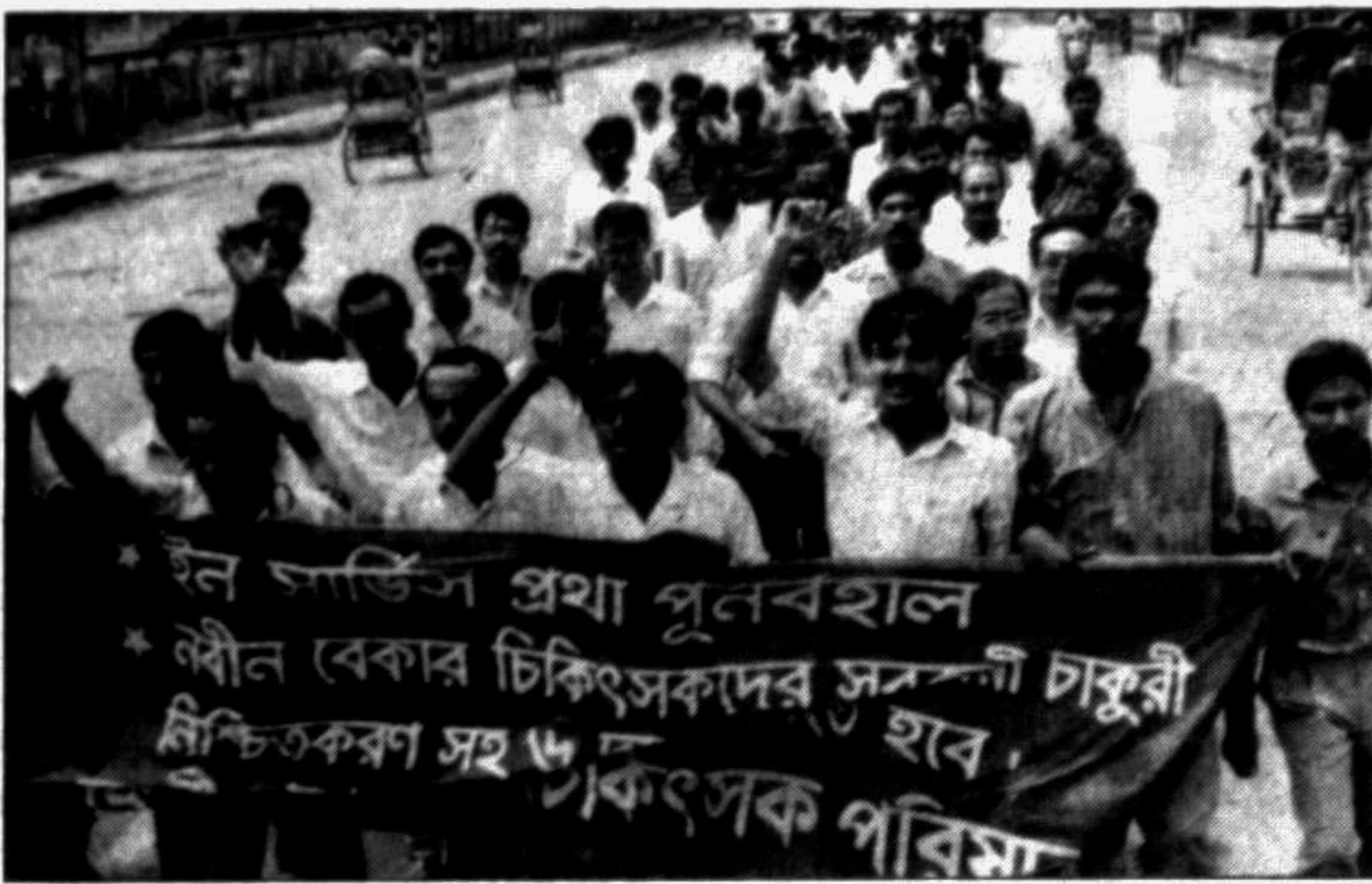
Internee doctors brought out a procession in the city Thursday to press home their demands.