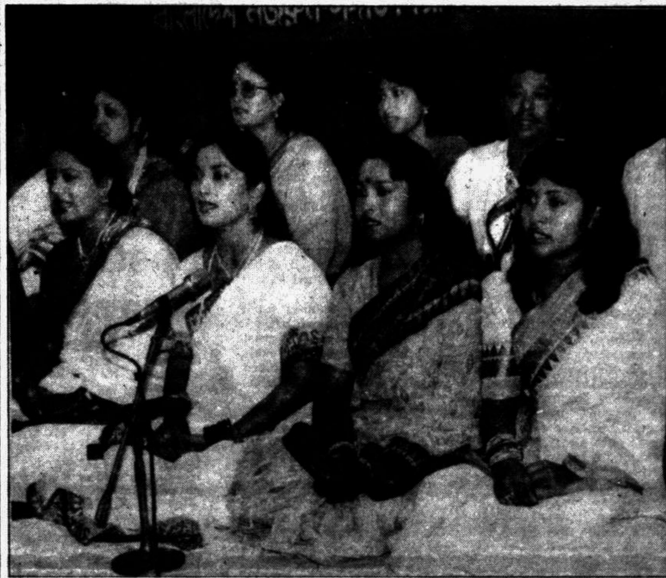
A cultural programme based on Nazrul songs was staged at the Shilpakala Academy auditorium yesterday to mark the poet's death anniversary.