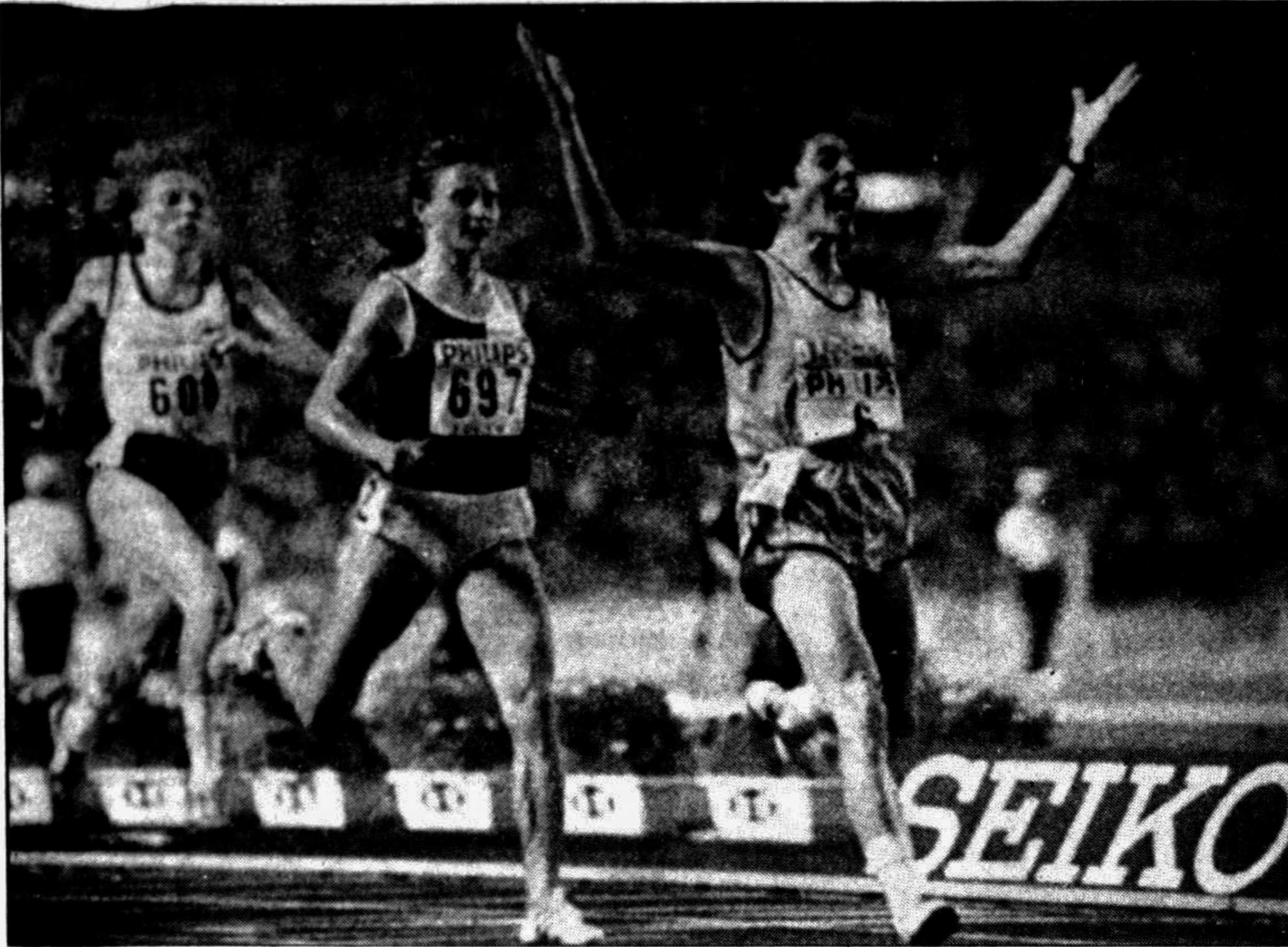
Hassiba Boulmerka of Algeria (R) celebrates her first place finish, with a time of 4 min 02.21 secs in the women's 1500 m at the World Championships on Aug 31. Soviet Union's Tatyana Dorovskikh (C) took the silver.