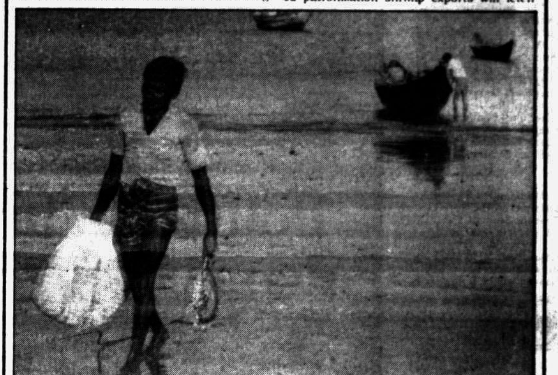
ON THE BEACH: A fisherman returning home after a day's catch—a pair of giant lobsters.