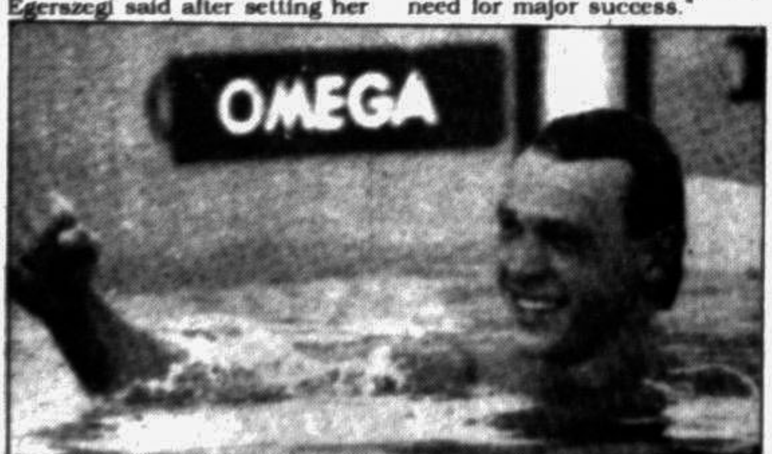
FLASHBACK: Norbert Rozsa reacts after setting the world record in the World Championships on January 7 in Perth, Australia.