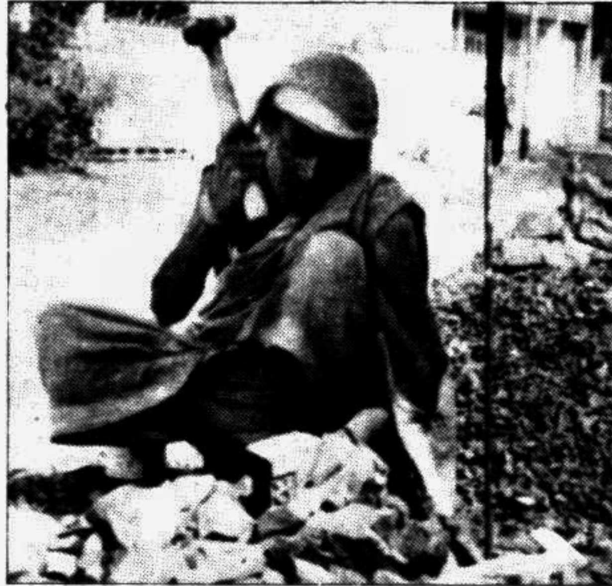
The sole earner of a family

These brick breakers, who cannot afford proper clothes, meals or medical attention, and who do not dream of having bank accounts or sending their children to even a free school, work with a smile. They chat, laugh and talk while they work. They do not crib or complain much, and take life as it comes, facing the consequences boldly. There is no undue whining or whimpering. More women workers should have their guts and gumption. If you compare them with the domestics that you come across every day, these tile breakers work much harder, and complain much less. They are landless people, making the best of the circumstances.