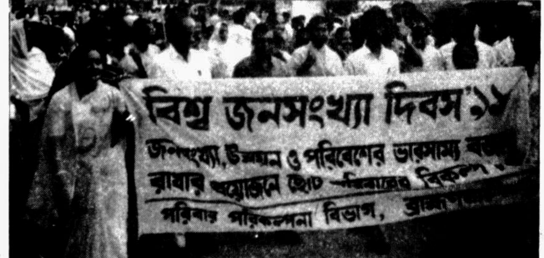
BRAHMANBARIA: A procession parading the town streets in observance of World Population Day recently.

The onion growers have urged the authorities to look into their problems and take immediate steps in this respect on priority basis.