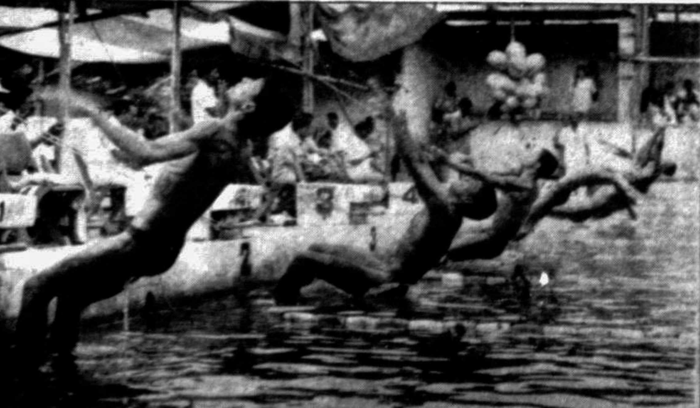
The start of the 100m backstroke event on Friday — the concluding day of the four-day national swimming championships at Dhaka Stadium pool.

Winner of the 1,575,000 mark (dfls 926,000) tournament that ends Sunday takes home 265,000 marks