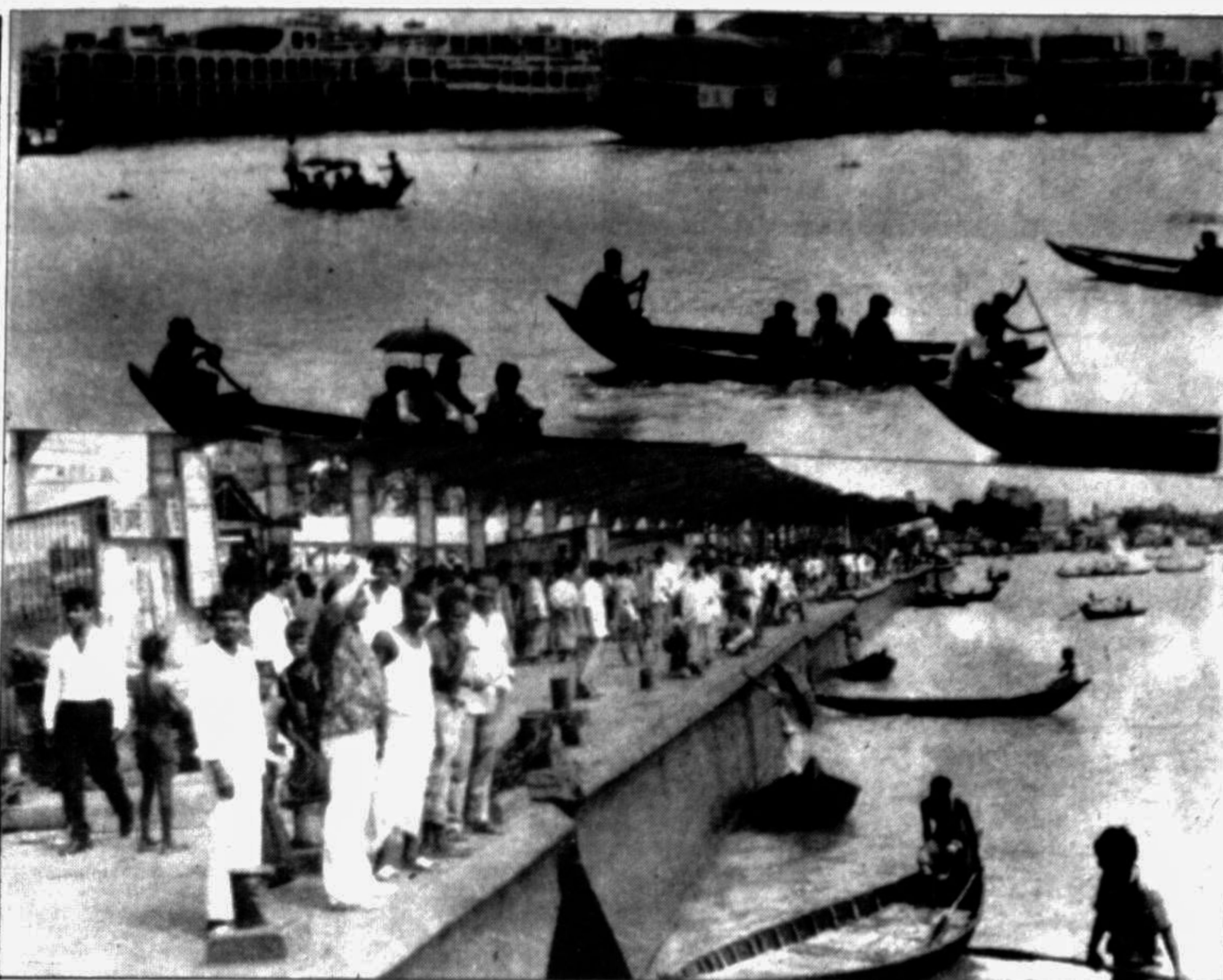
Launch passengers looking helpless (above) at Sadarghat terminal on Saturday as all Water Transports went off different routes due to river transport owners' strike. Double-deckers (below) were used in the river as a blockade against movement of transports

Ambassador Lohani expressed his gratitude for the excellent cooperation he received from all circles in Bangladesh.