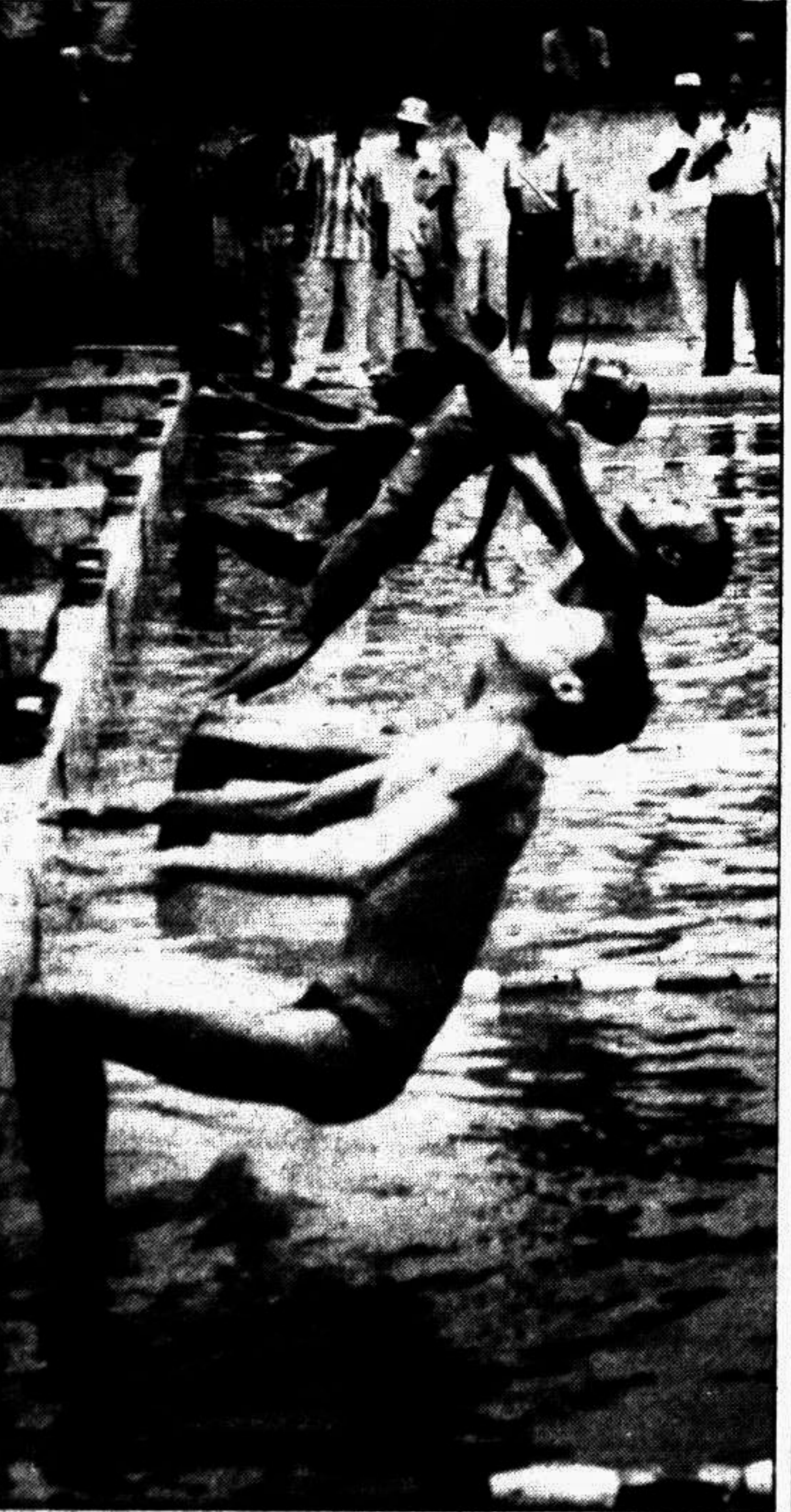
The start of the 4x100m relay event in the 14th National Swimming Championships at the Dhaka Stadium swimming pool yesterday.

TOKYO, Aug 21: A Paris-Moscow-Beijing automobile rally involving 199 vehicles has been postponed because of political unrest in the Soviet Union, organizers said Wednesday, reports AP.