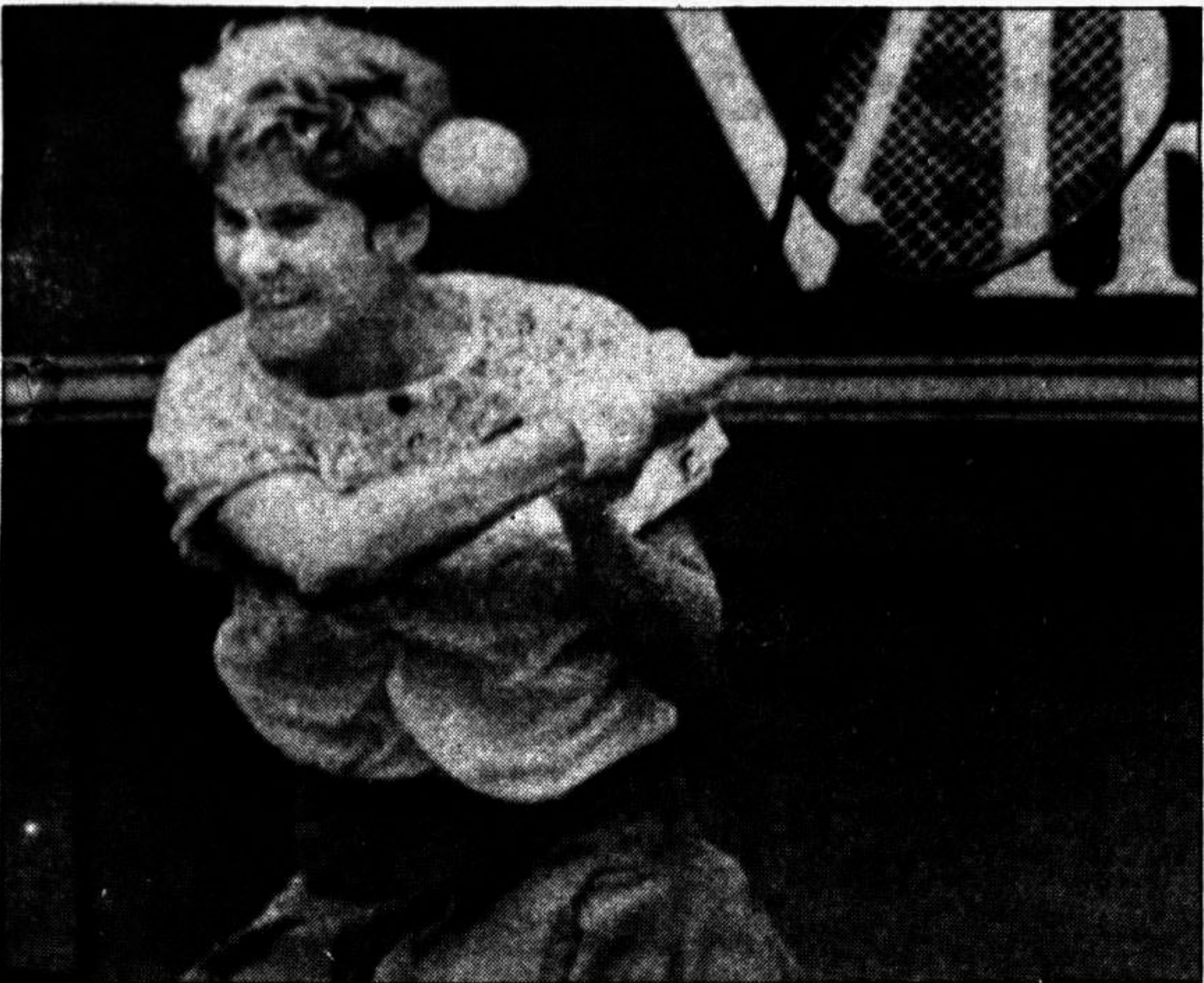
Yugoslav Monica Seles, the top rated women's tennis player in the world, prepares to hit a backhand on Aug. 17 to Spain's Arantxa Sanchez Vicario in Semifinals of Virginia Slims tournament.