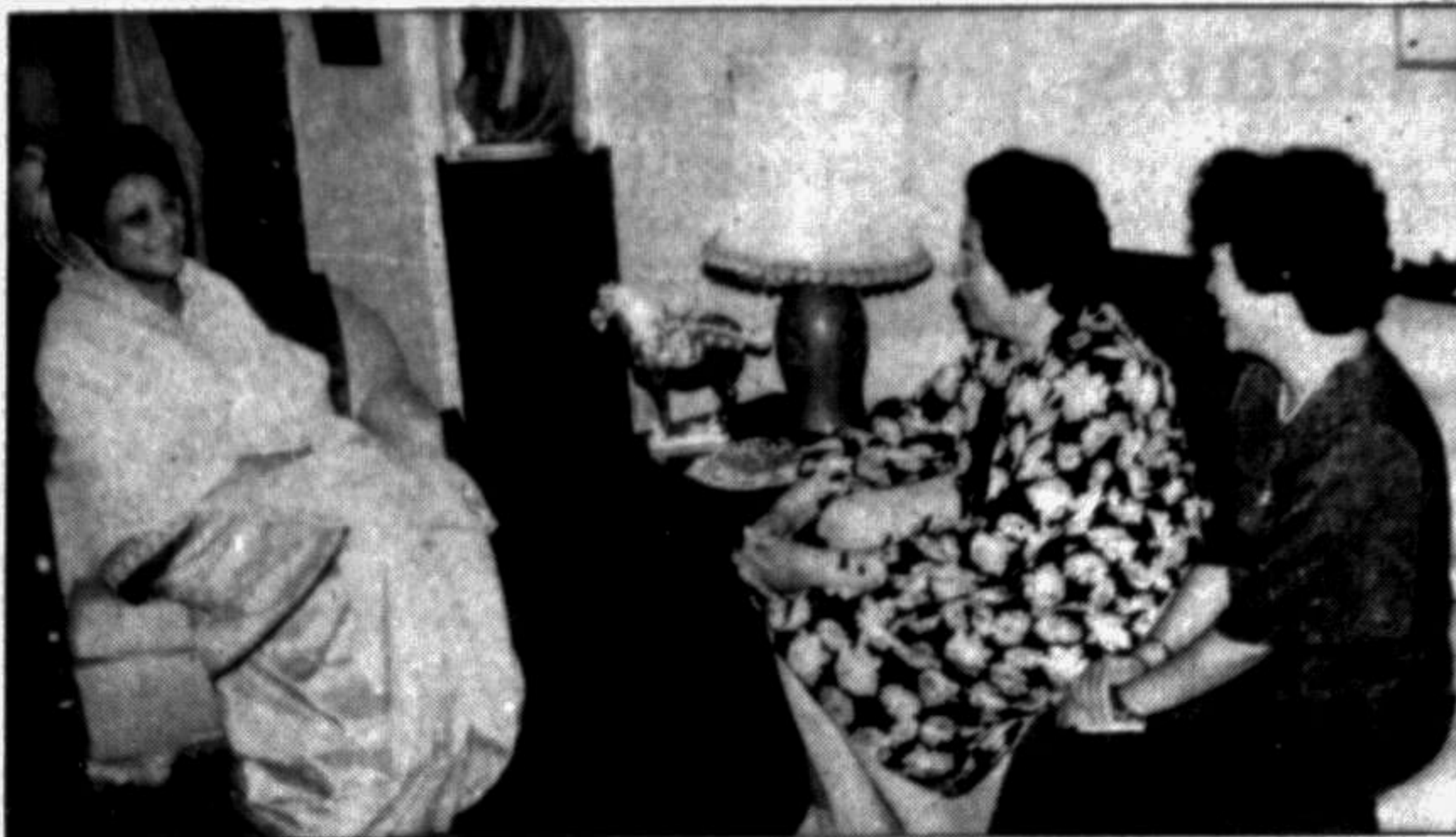
Chinese special envoy Madame Chen Muhua called on Prime Minister Begum Khaleda Zia at her residence yesterday. She is leading a Chinese delegation who will attend the Shambhuganj bridge opening ceremony today.

Ministry of Irrigation would prepare a comprehensive report on the earlier phase of the project funded through its own resources. It was also decided that further expansion of the project including eastern part of Dhaka city will be considered by the Committee on receipt of economic and financial feasibility reports of the project.