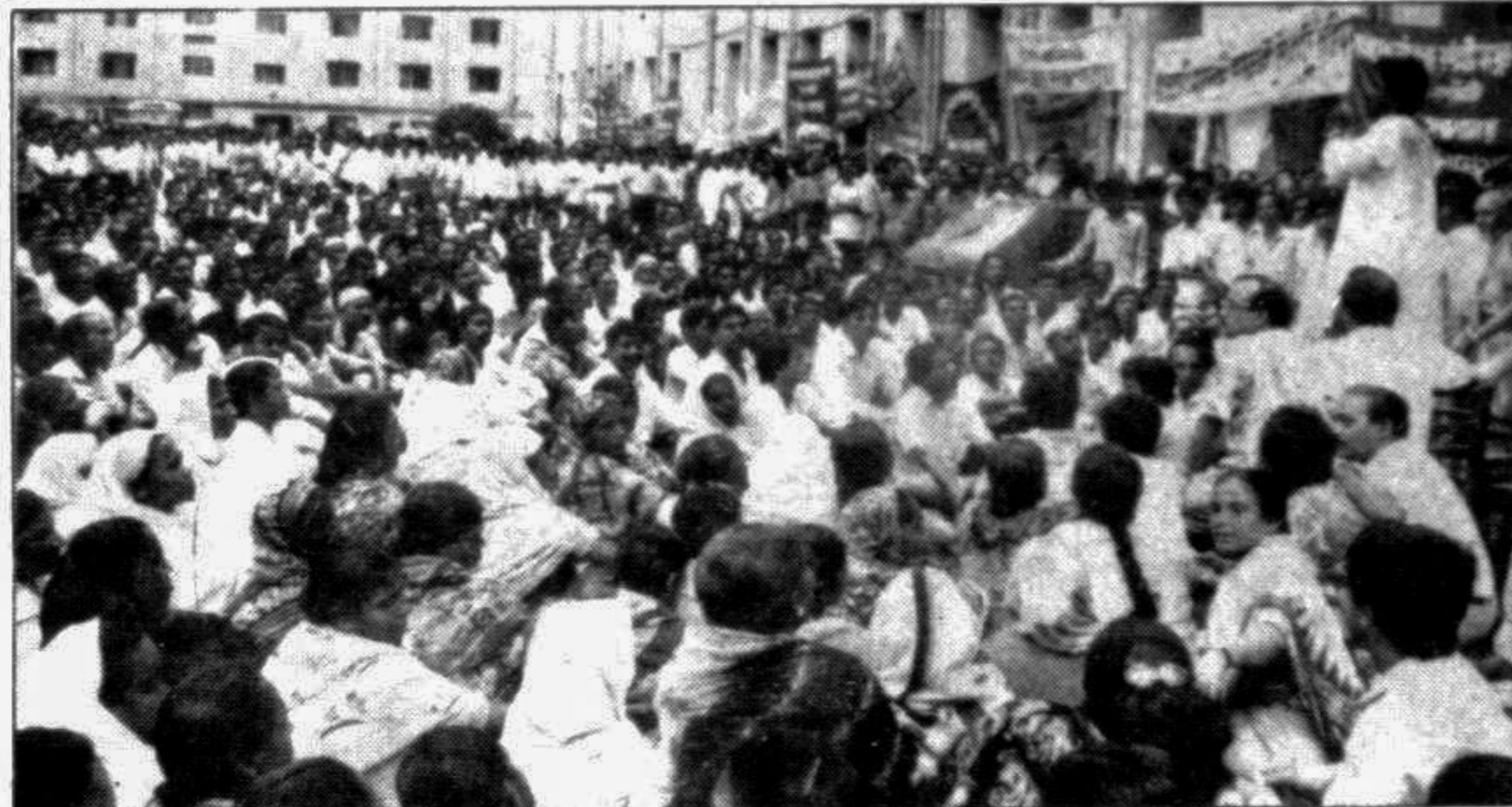
Government employees holding a rally inside the Secretariat during their 4-hour work stoppage yesterday demanding pay like and revised office timing.

Further Chinese assistance on similar project would continue depending on the needs and capabilities of two countries, she said.