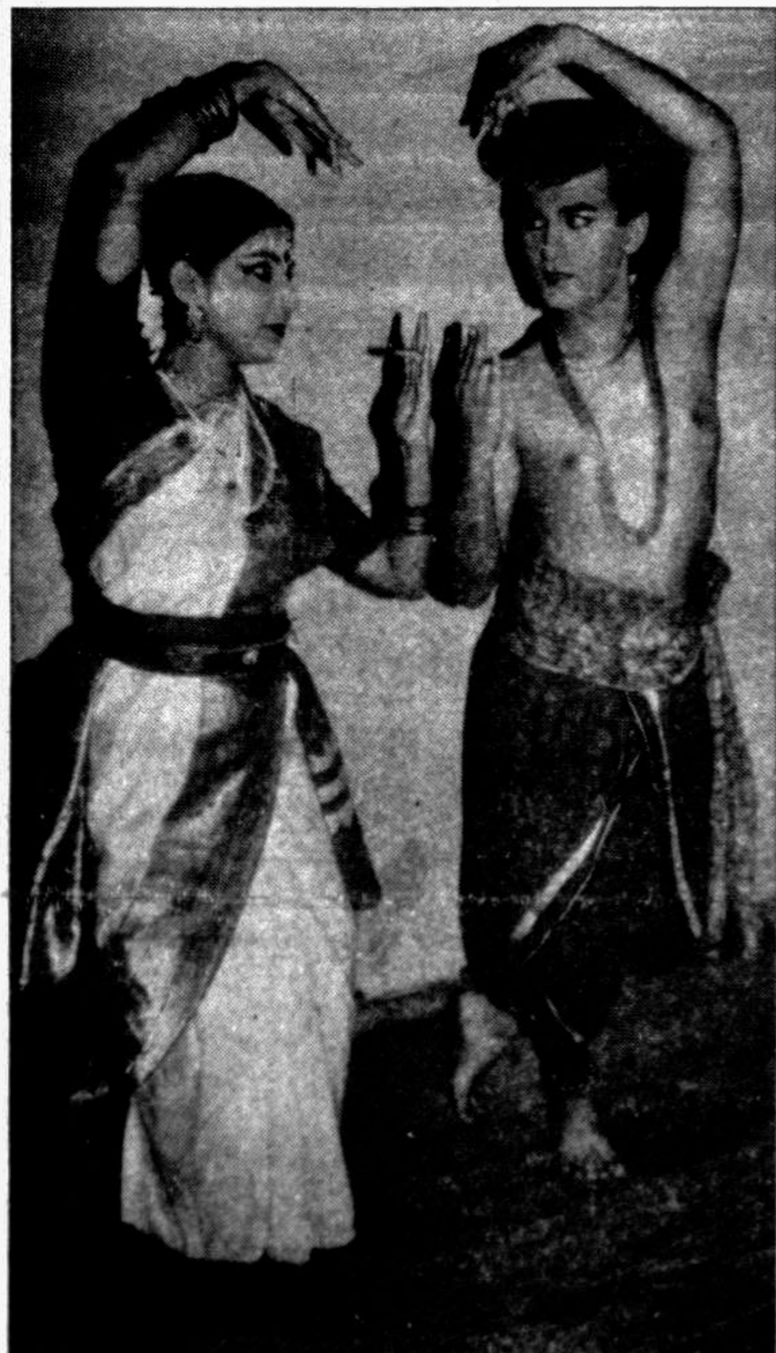
Snap from a dance drama, part of a cultural programme, staged at Shilpakala Academy on Friday in observance of the anniversary of Tagore's death.