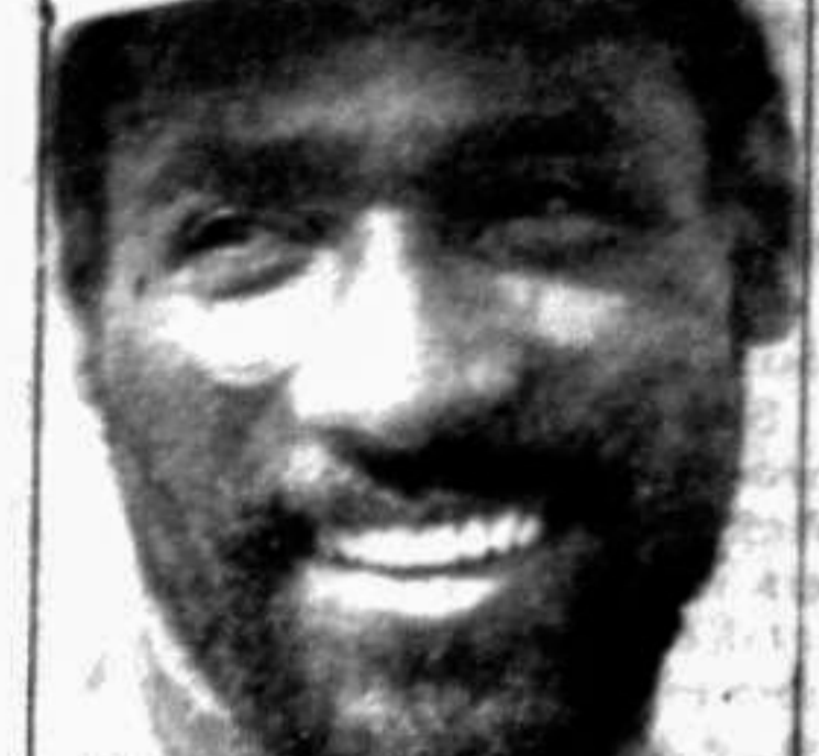
VIV RICHARDS Dojon will not again grace the international stage.

West Indies do not play another Test series for 15 months and in all probability Richards and his illustrious team mates Gordon Greenidge, Malcolm Marshall and Jeff