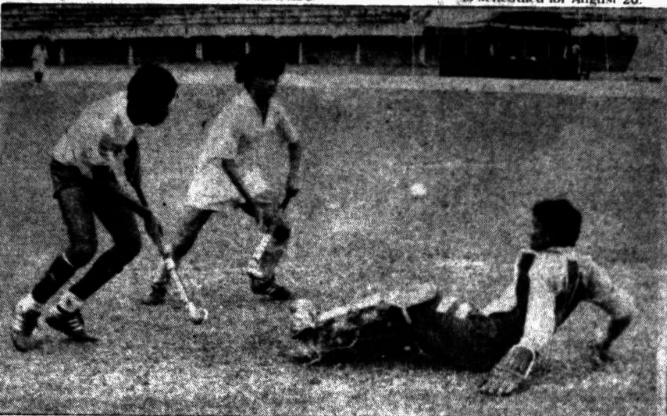
Action from yesterday's national hockey championship match between Dhaka DSA and Bangladesh University of Engineering and Technology (BUET) at the Hockey Stadium. Dhaka won by 7-1.