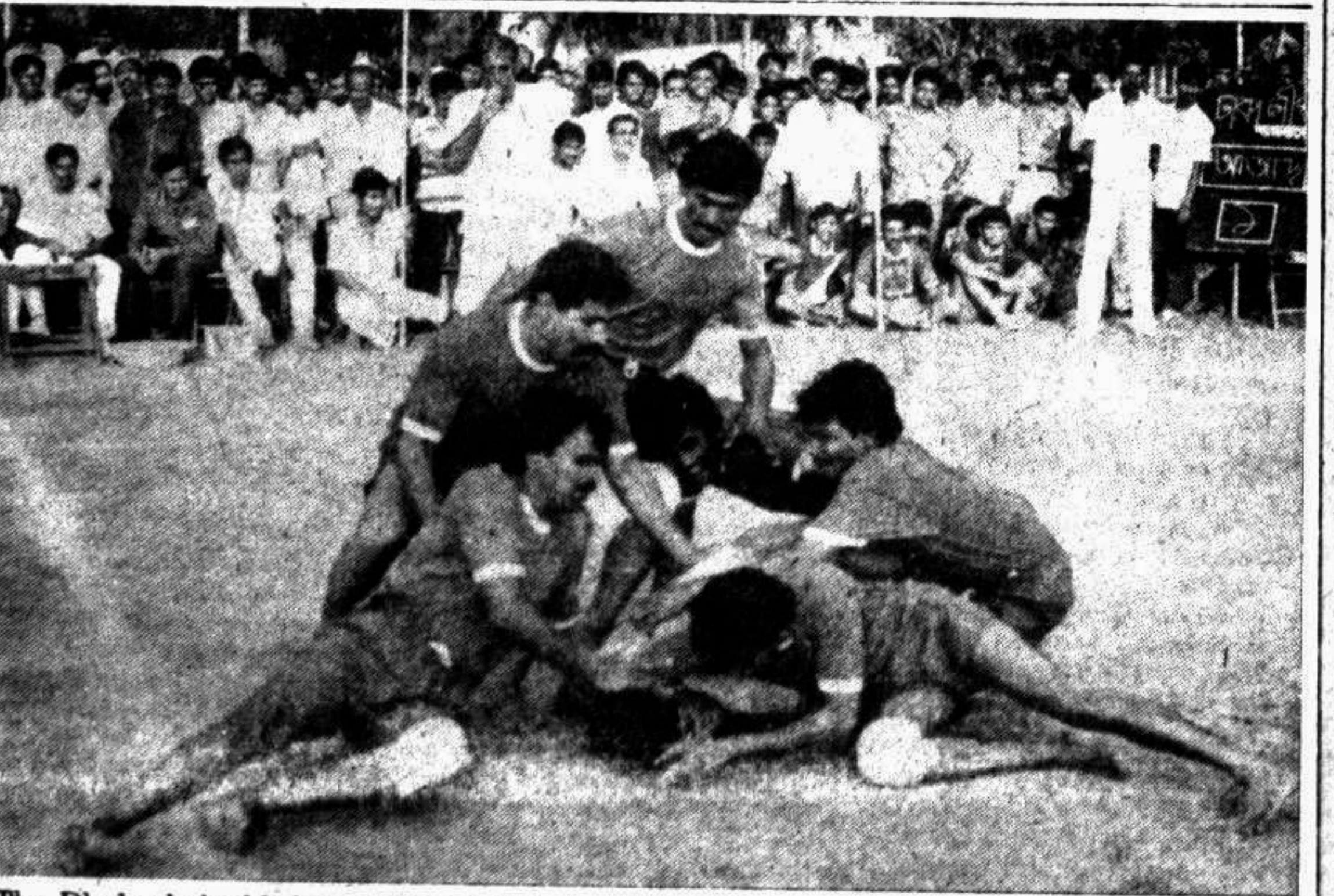
The Dhaka kabaddi league match between Azad Sporting Club and Anirban Sangsad in progress yesterday at Outer Stadium kabaddi court.

Big-spending Blackburn Rovers are also reported to be chasing McAvennie.