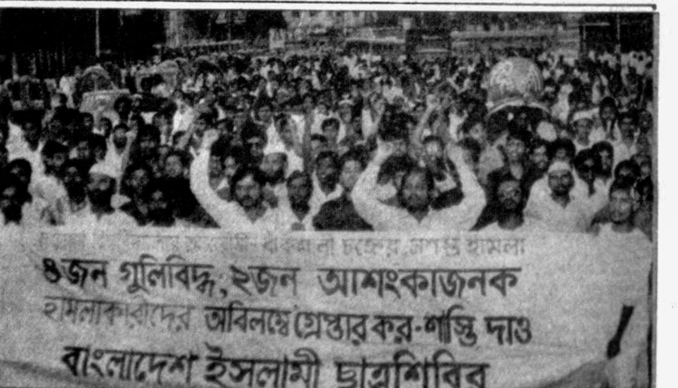
Islamic Chhatra Shibir brought out a procession in the city Wednesday protesting aimed attack on its activists at CU allegedly by BCL (A-A) workers.