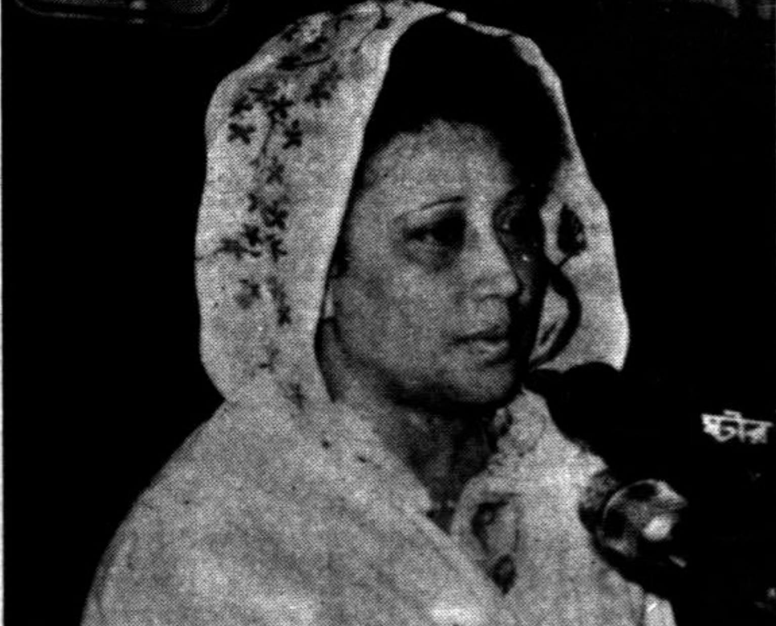
Prime Minister Begum Khaleda Zia speaking at the founding anniversary function of Zia Shishu-Kishore Sangatan at the Shishu Academy Wednesday.