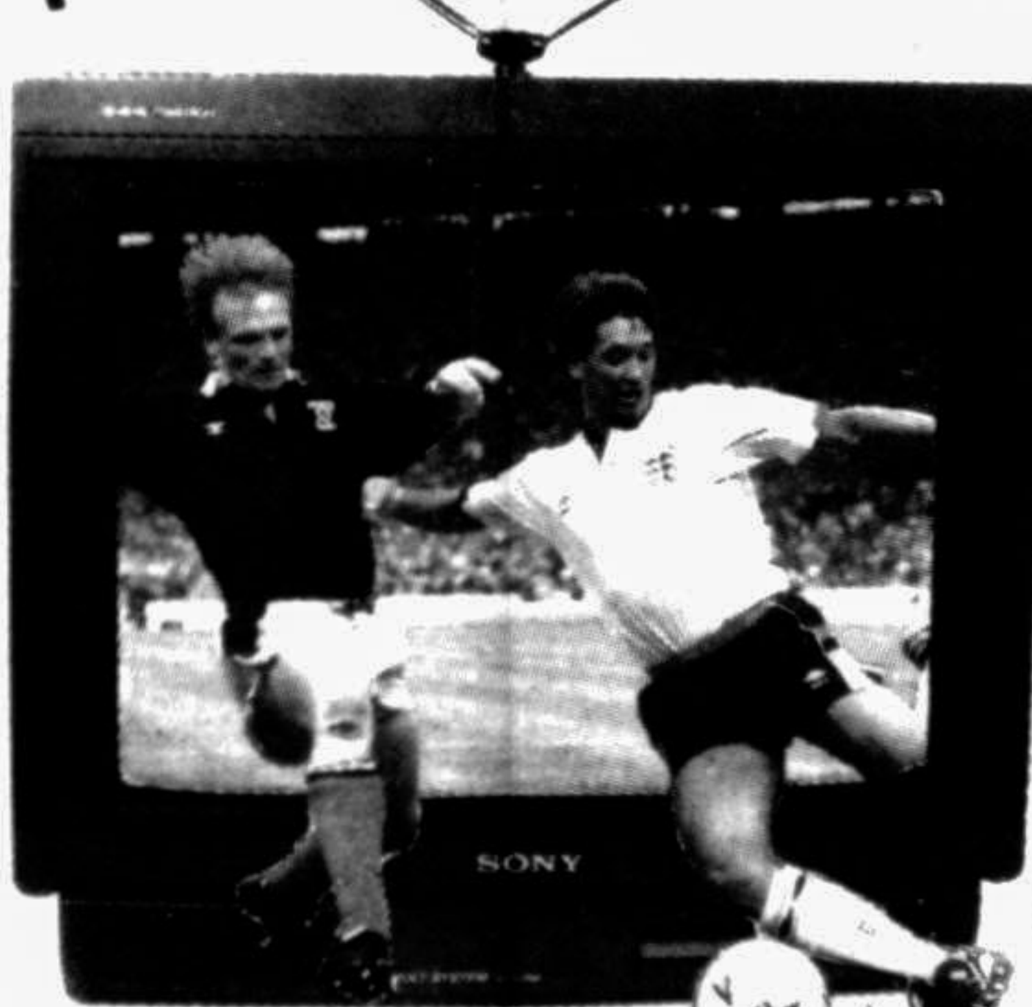
Model KV 2102 GE (21)

Picture full of life and sound Always with you when SONY is around