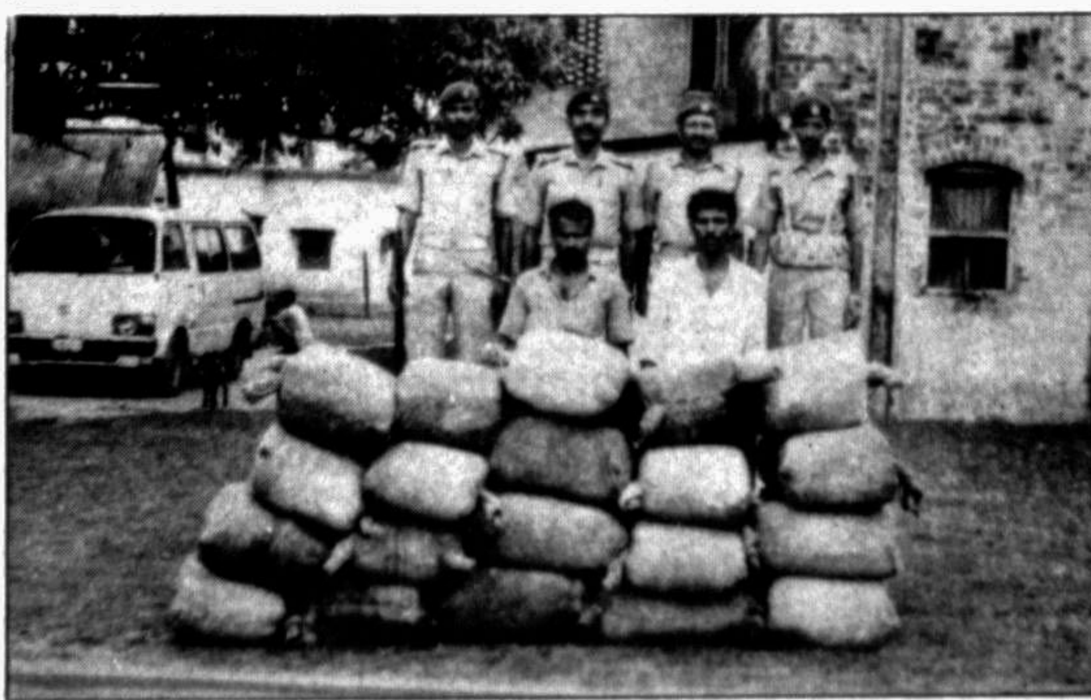
CHAPAINAWABGANJ: Smuggled Indian cotton yarn packed in gunny bags recovered by local police recently.

There are more than 5,000 dogs in this township. A large number of dogs lies down at night around hotels, restaurants, verandahs of shops and fish, meat and vegetables markets.