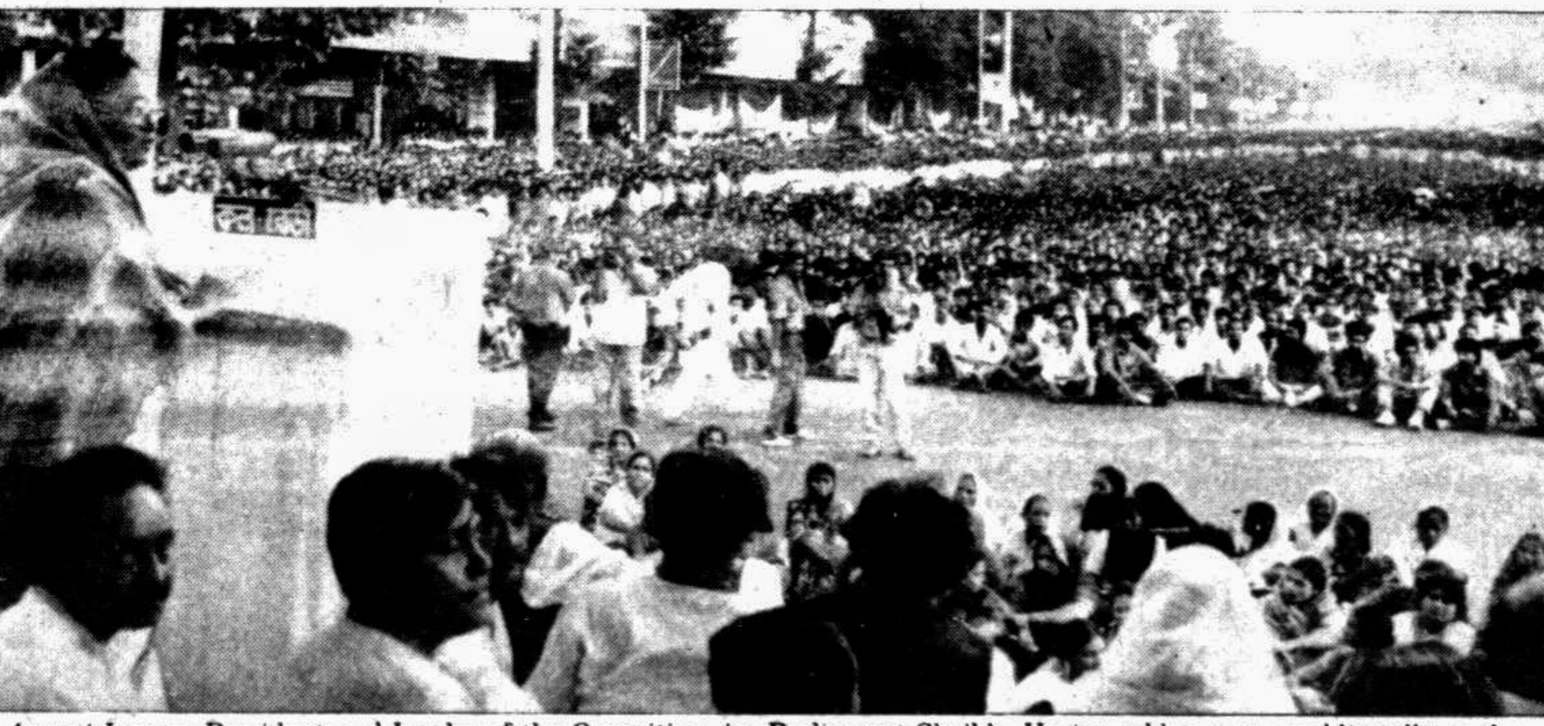
Awami League President and Leader of the Opposition in Parliament Sheikh Hasina addressing a public rally at the Bangabandhu Avenue in the city Wednesday.