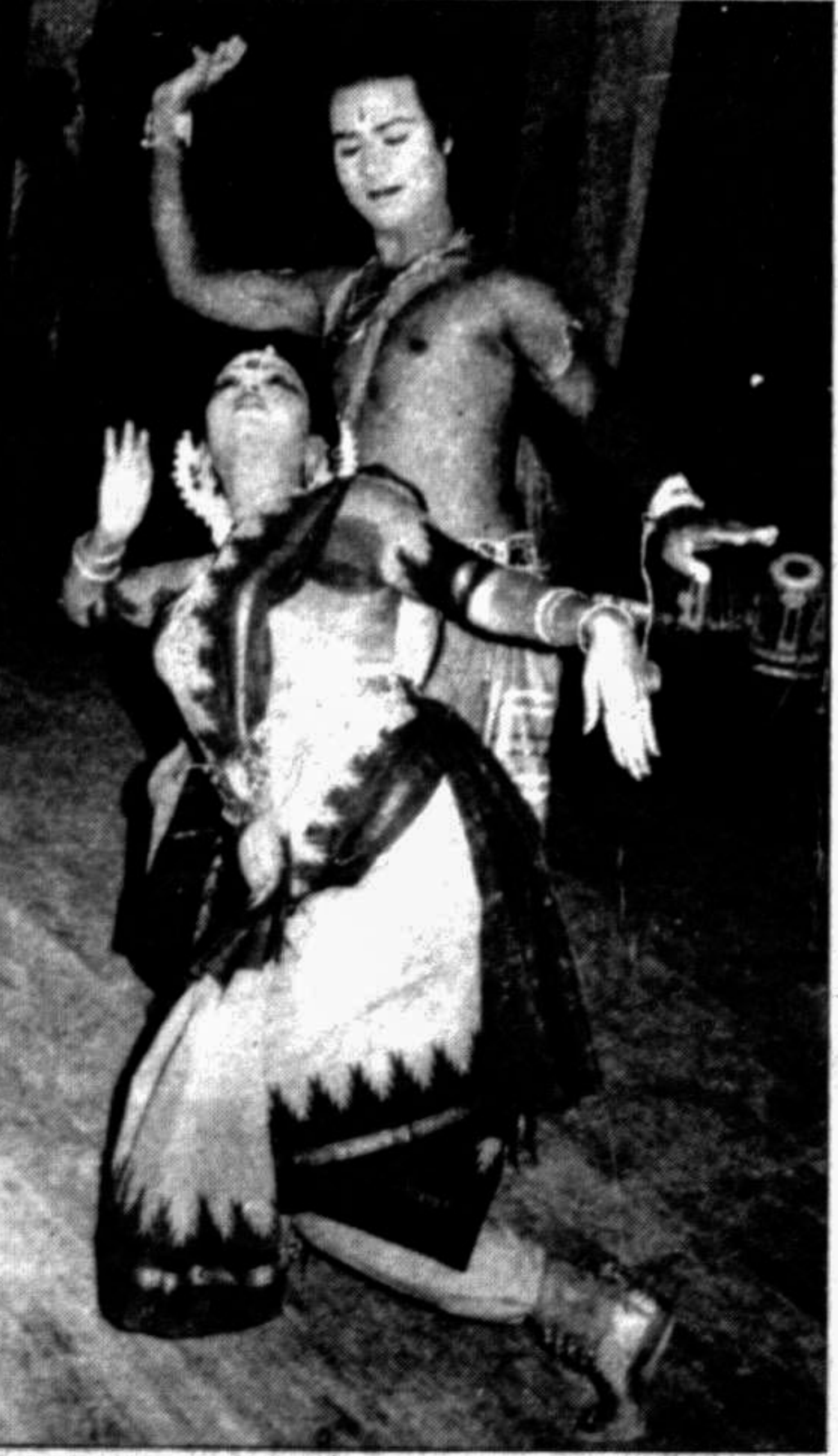
Rabindrasangeet Shilpi Sangstha staging a variety show at Shilpakala Academy in the city in observance of Rabindranath's death anniversary yesterday. Story on page 12