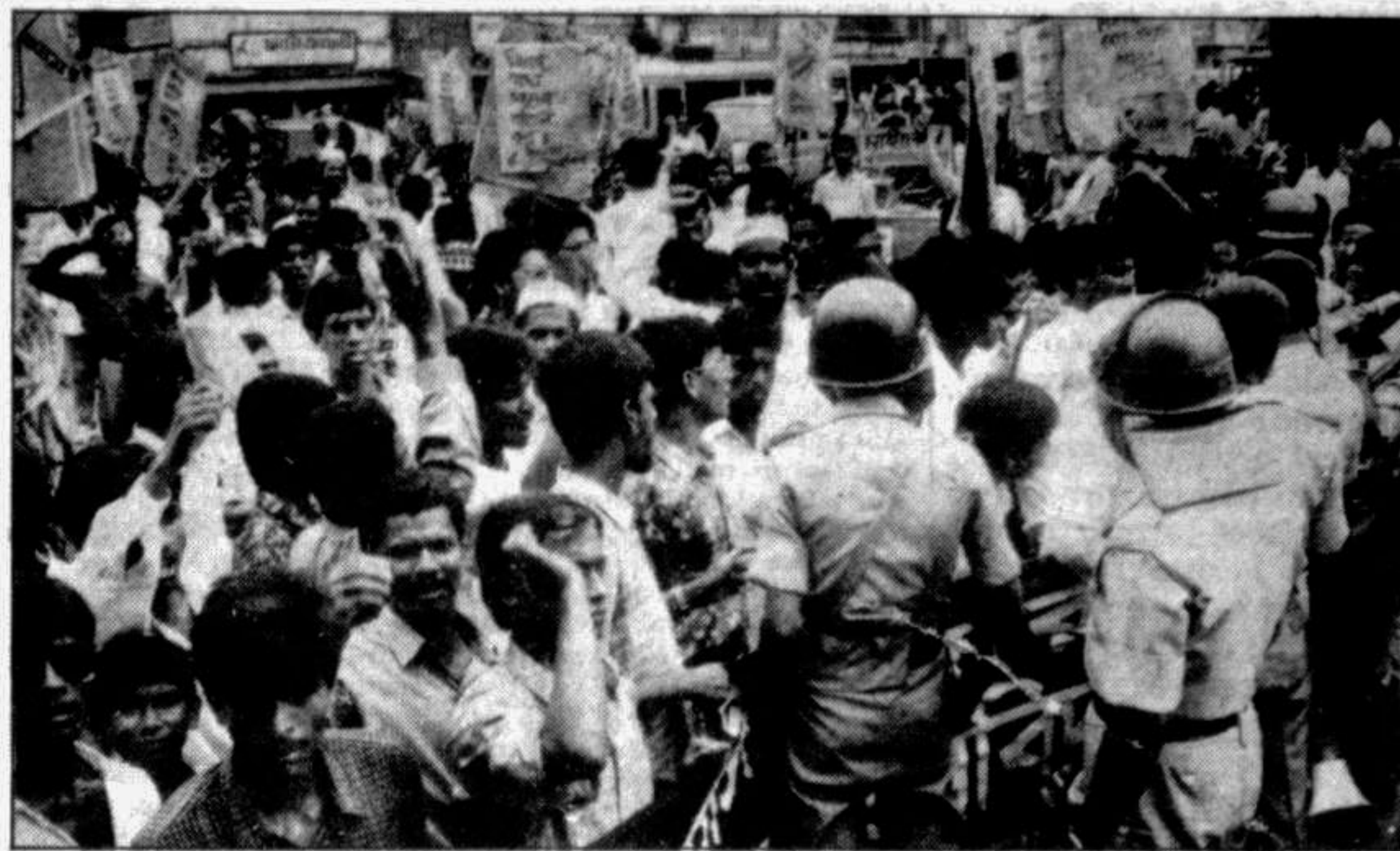
Islami Chhatra Majlis brought out a procession in the city on Tuesday in protest against terrorism on the campuses.

Rain or thundershower will occur at many places over Chittagong and Khulna divisions and at a few places over Dhaka and Rajshahi during the next 24 hours ending 6 pm Wednesday, Met Office reported. Day temperature is expected to remain nearly unchanged over the country. Teknaf recorded the highest amount of rain 15 mm during 12 hours ending 6 pm on Tuesday. Dinajpur had 7 mm, Majdi Court 6 mm and Bhola 4 mm during the same period. Maximum temperature in Dhaka on Tuesday was 31.4 degree Celsius and the minimum 26 degree. Rajshahi recorded the highest temperature 33.5 degree Celsius while Feni the lowest 23.3 degrees. The sun sets on Wednesday at 6-39 pm and rises on Thursday at 5-31 am. Temperature and humidity in some cities and towns of the country on Tuesday were: Cities/Towns Temperature in Celsius Humidity in percentage Max Min Dhaka 31.4 23.0 Chittagong 31.5 24.5 Khulna 32.4 26.4 Rajshahi 33.5 26.5 Cox's Bazar 30.5 24.4 Sylhet 32.0 23.8 Srimangal 32.6 25.5 Isahrdi 32.0 26.0 Rangpur 31.7 24.9 Bogra 32.5 26.3 Barisal 30.3 25.8 Mymensingh 31.7 24.3