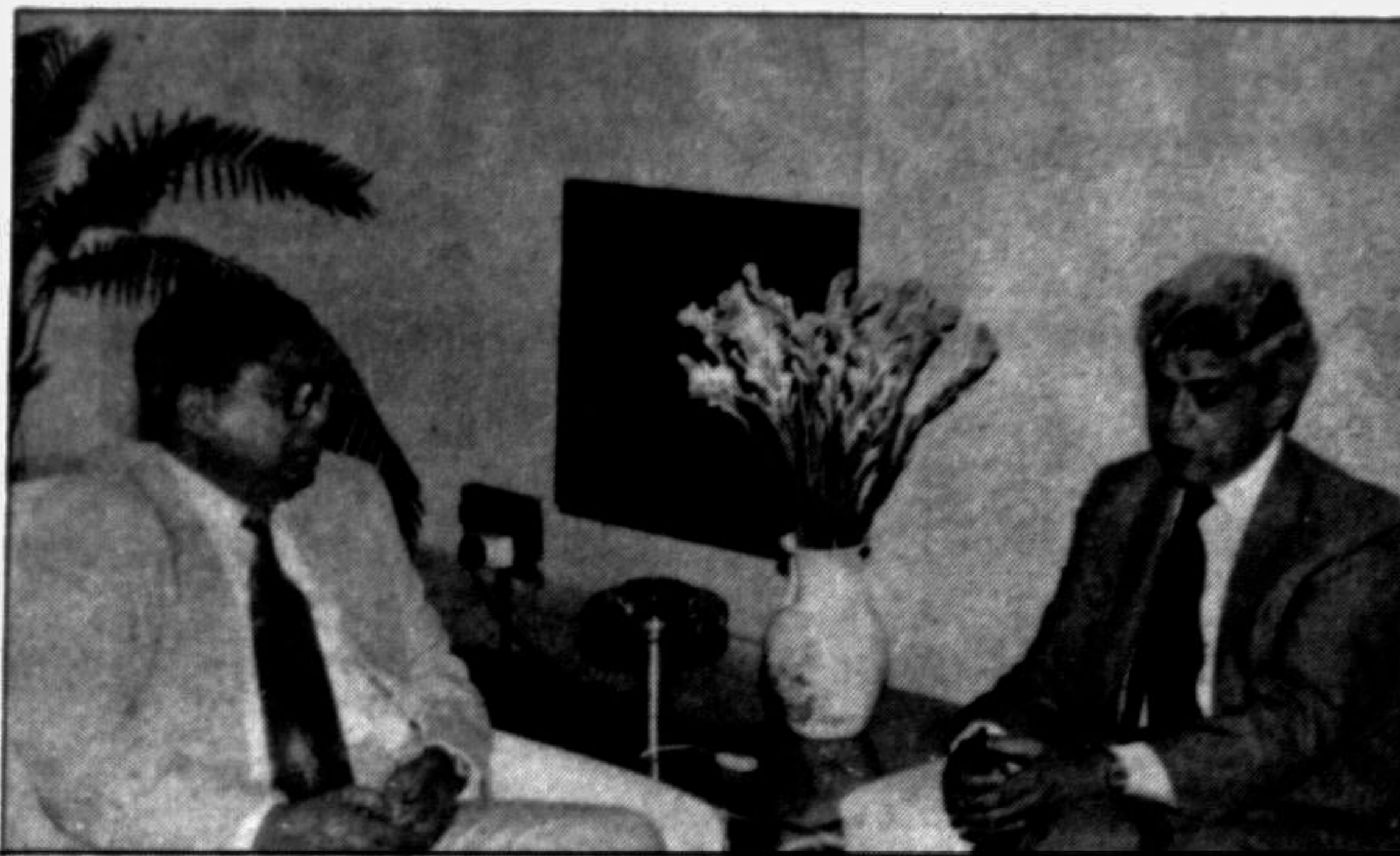
Visiting Vice-President of World Bank Attila Karaosmanoglu called on Industrial Minister Shamsul Islam Khan at his office on Monday. Story on Page-7

Bangladesh Railway introduced a daily Container Express Train between Dhaka and Chittagong from Monday ushering a new era in goods transportation in the country, reports BSS. This new service will take only thirteen hours to reach Chittagong. The Container Express will leave Dhaka at 7-30 pm and Chittagong 7 pm everyday. Customs clearance for both-way booking is now being done at Dhaka ICD. All sorts of banking facilities are also available at the Dhaka container depot now. The first Container Express Train for Chittagong was inaugurated at the Dhaka Railway Station Monday evening at a simple ceremony. Senior Railway and Sports officials, members of the Shippers Council and Shipping Lines were present on the occasion.