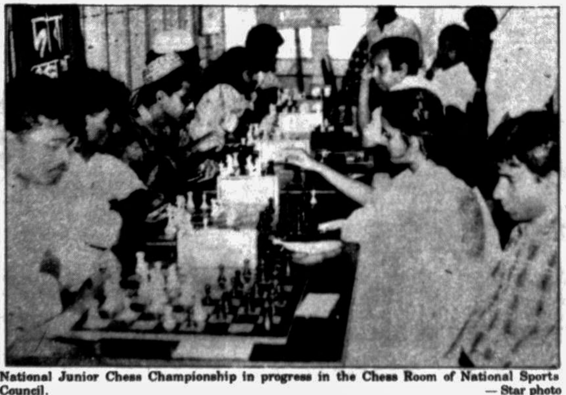
National Junior Chess Championship in progress in the Chess Room of National Sports Council.