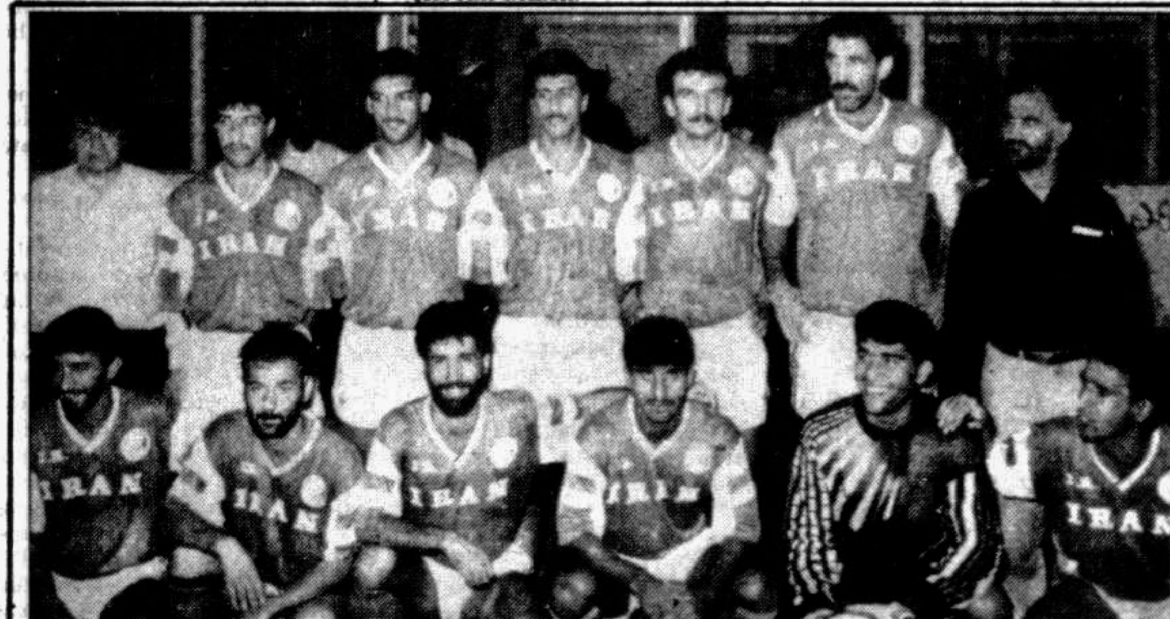
The 10th Asian Club soccer champions Esteghal Club of Iran pictured before the start of yesterday's final at Dhaka Stadium.