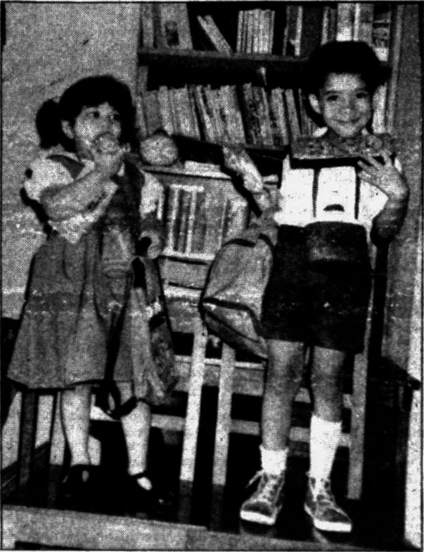
Schooling of the little ones: A major problem

Attending schools in the city is no easy job either. The city streets are full of unpredictable dangers. Children have to be accompanied by their guardians. Auto-rickshaws demand high fares during busy school hours. Public buses or tempos are cheaper but difficult for the children with their overloaded passengers. The car is, however, a safer mode of transportation to schools. But if the school is near Dhaka College, Dhaka University or City College then the car too is not the answer. Every now and then the police will not allow cars in those areas