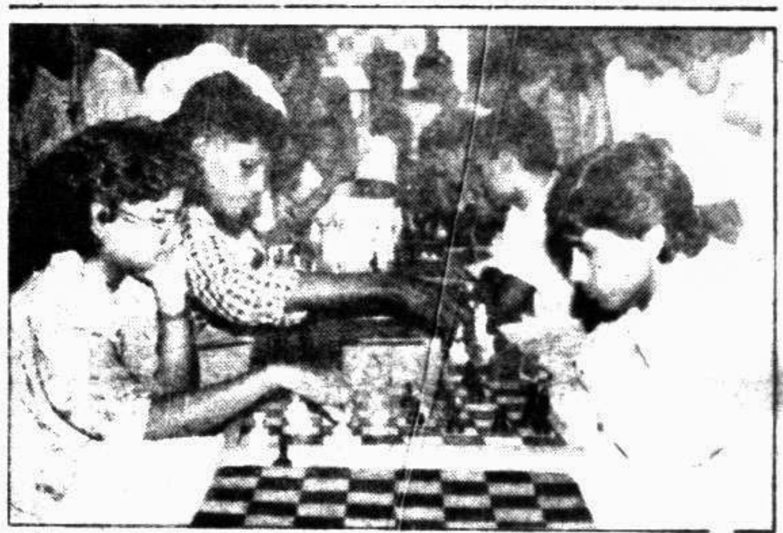
The twelfth National Junior Chess championship in progress yesterday at the Chess Room of the National Sports Council.

Rain reduced Sri Lanka's target to 151 from 41 overs.