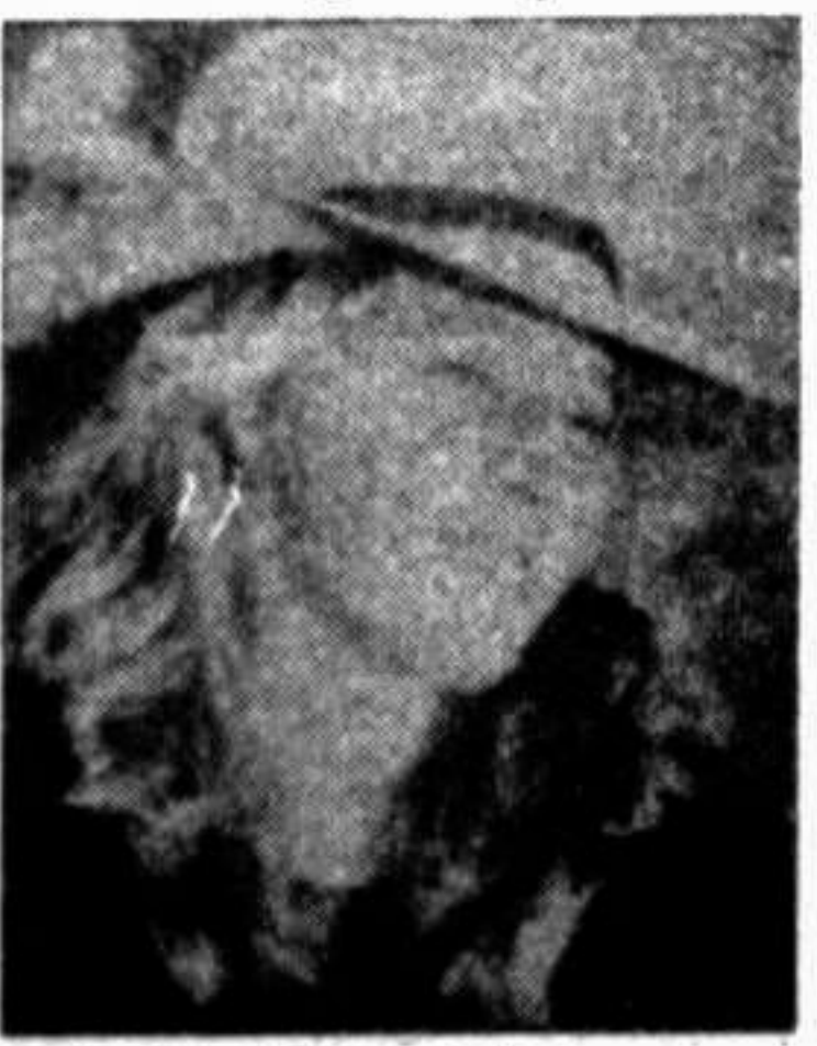
STEFFI GRAF gan having pain in her right shoulder in the second set. It was the same problem that forced her to pull out of a German exhibition in May.