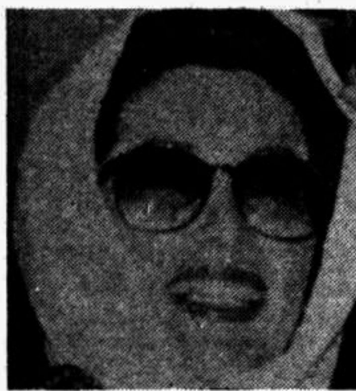
ing political and economic crisis in Pakistan, demanded snap elections Wednesday.