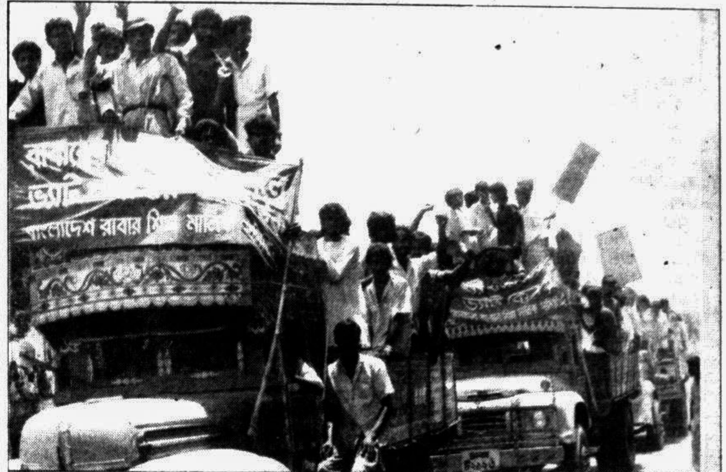
Bangladesh Rubber Industries Owners' Association brought out a truck procession in the city Thursday demanding withdrawal of VAT imposed on rubber industries.