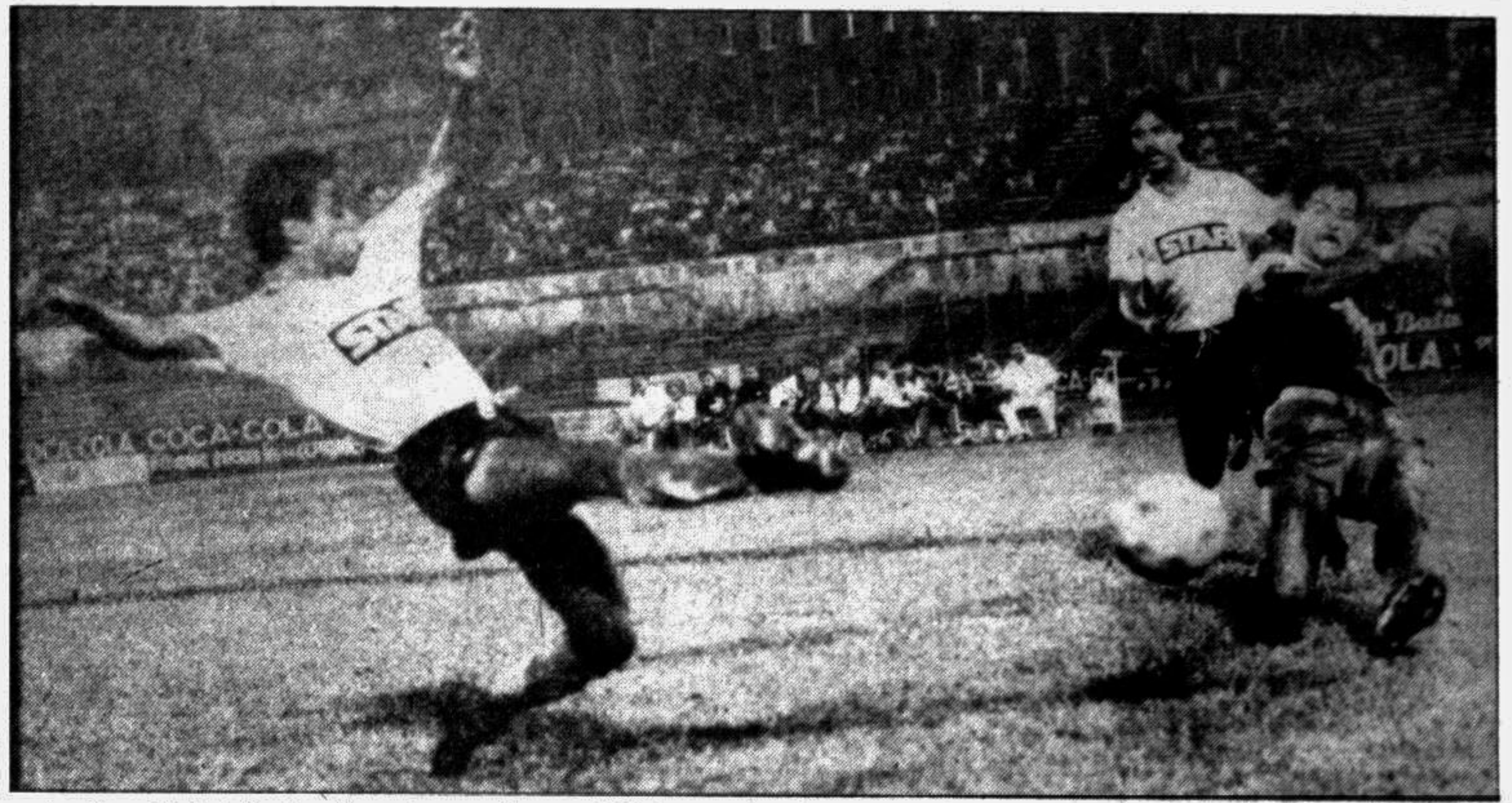
An Esteghal defender thwarts one of several Mohammedan forays into their goal in Tuesday's crucial robin league match of the 10th Asian Club Cup championship at Dhaka Stadium.

Lusis, who won a gold medal for the Soviet Union at the Mexico Olympics in 1968, was quoted by the Ilt-Sanomat newspaper as saying, "I used them, too," in reference to banned substances. The newspaper said Lusis immediately added: "However, I made my best results without substances." Lusis did not say when he had used the drugs or specify what he had taken.