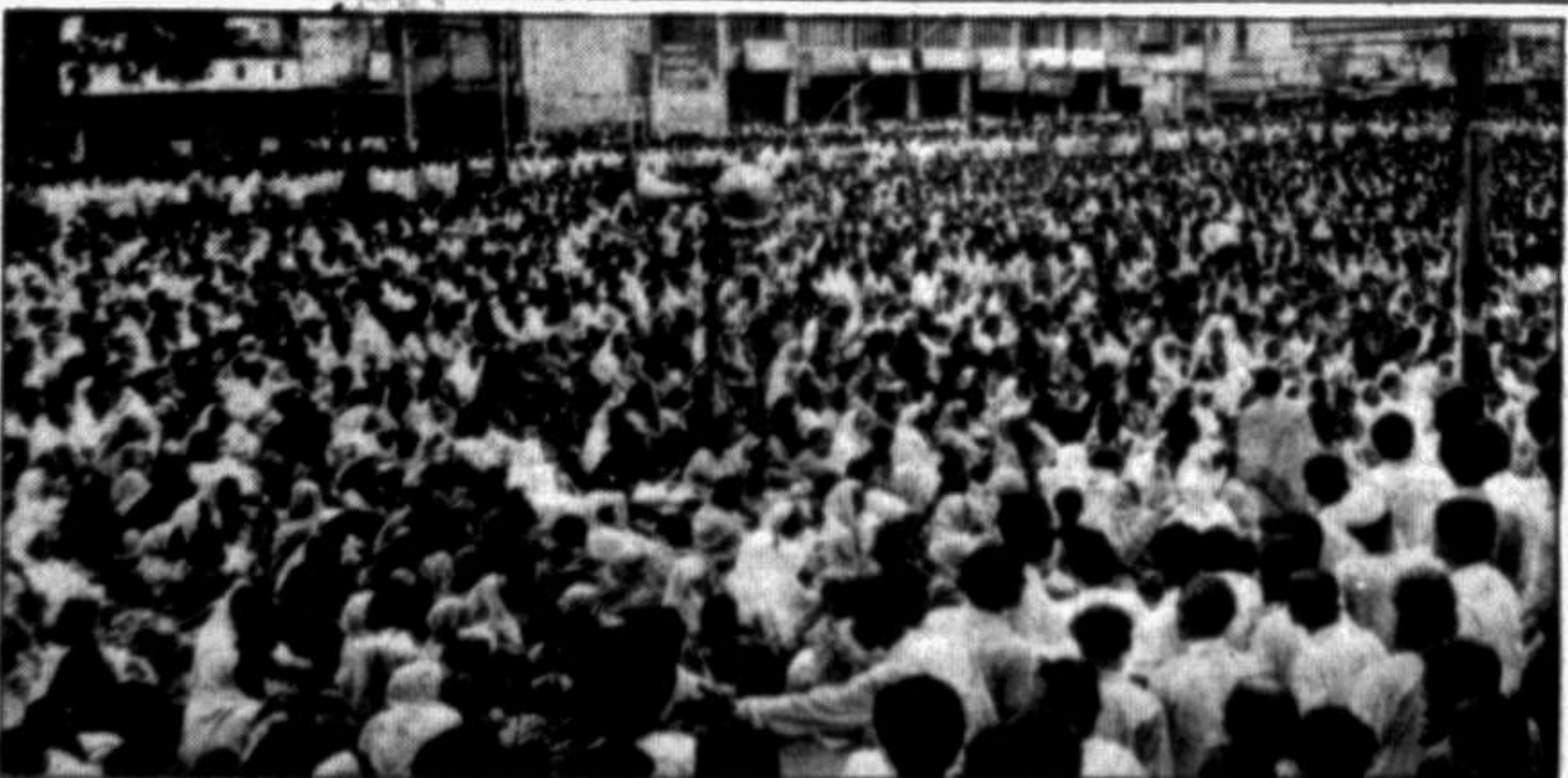
Government employees holding rally in the city on Monday demanding implementation of Pay Commission immediately.

The members exchanged their views on the WUS curriculum.