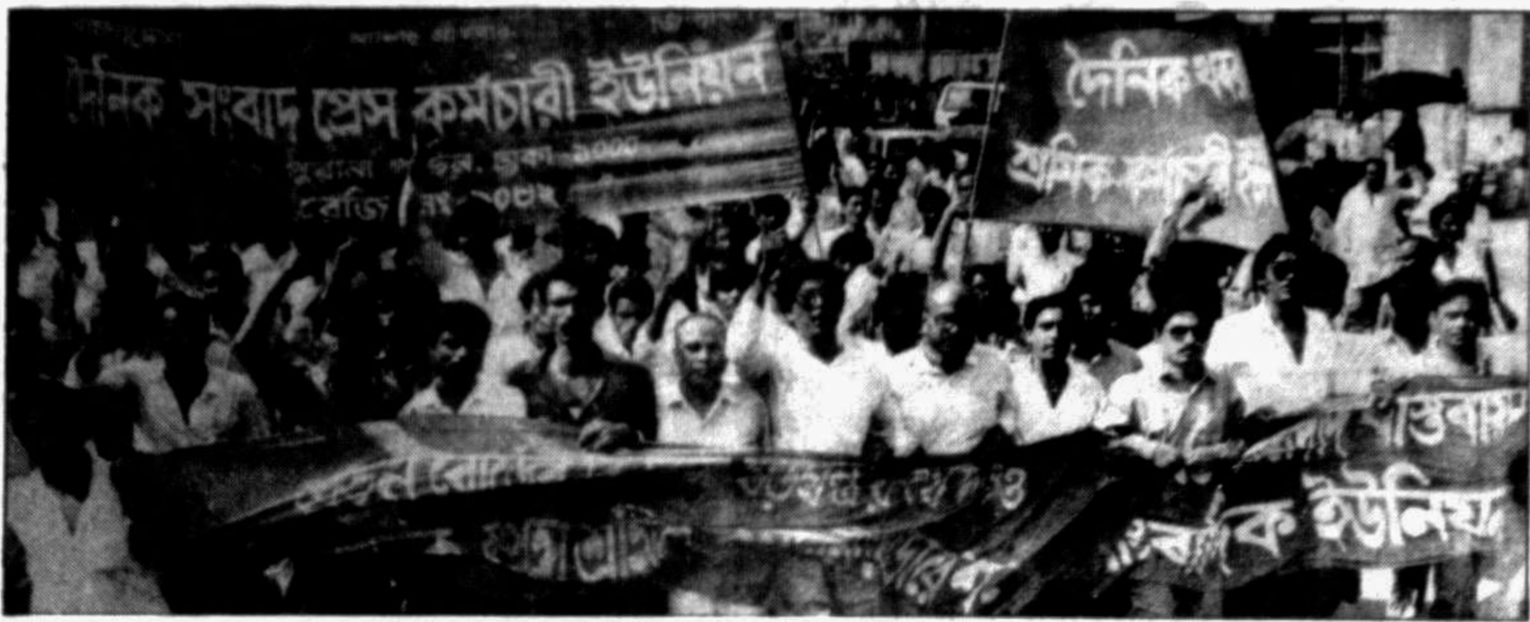
Journalists, Newspaper press workers and employees jointly brought out a procession in the city on Monday to press home their demand for enhanced salary and allowances.