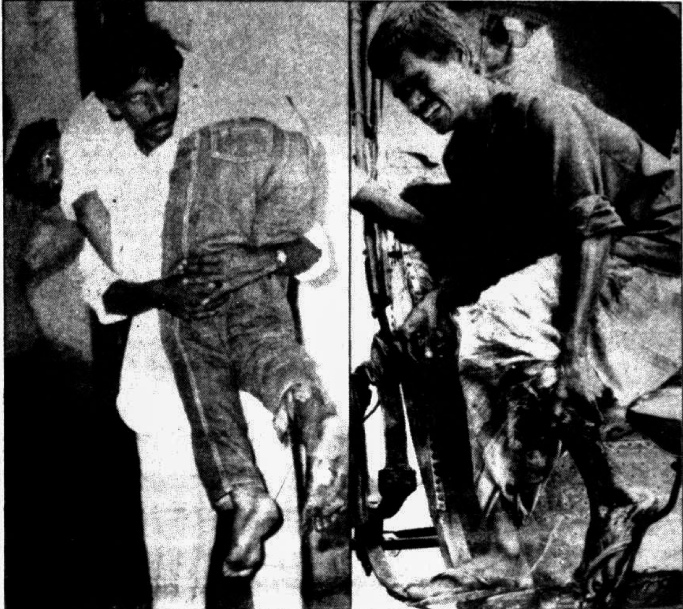
Left: One of the wounded students being carried by his fellow student to safety. Right: a rickshawpuller with bullet injuries in his leg. Twenty persons were wounded in a shootout at Suhrawardy College in the city Monday.