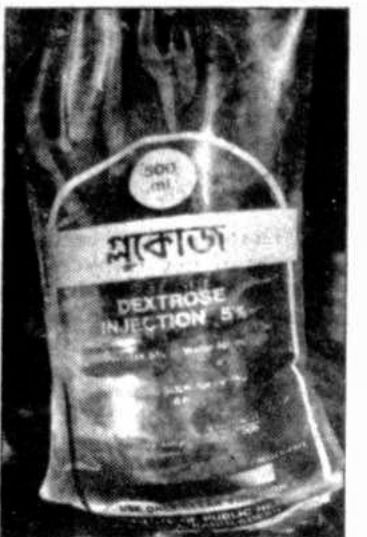
Glucose injection with fungus deposit.

The impure ampicillin powder was produced in July, 1989 and its expiry time was July 1992. The medicine is most commonly used for a variety of ailments. There is no doubt a village quack would have administered this contaminated medicine to a child without hesitation. It could not be gathered as to how many phials of this ampicillin powder have been sold in the market. The pharmacist at Rampura procured the item from Mitford drug market.