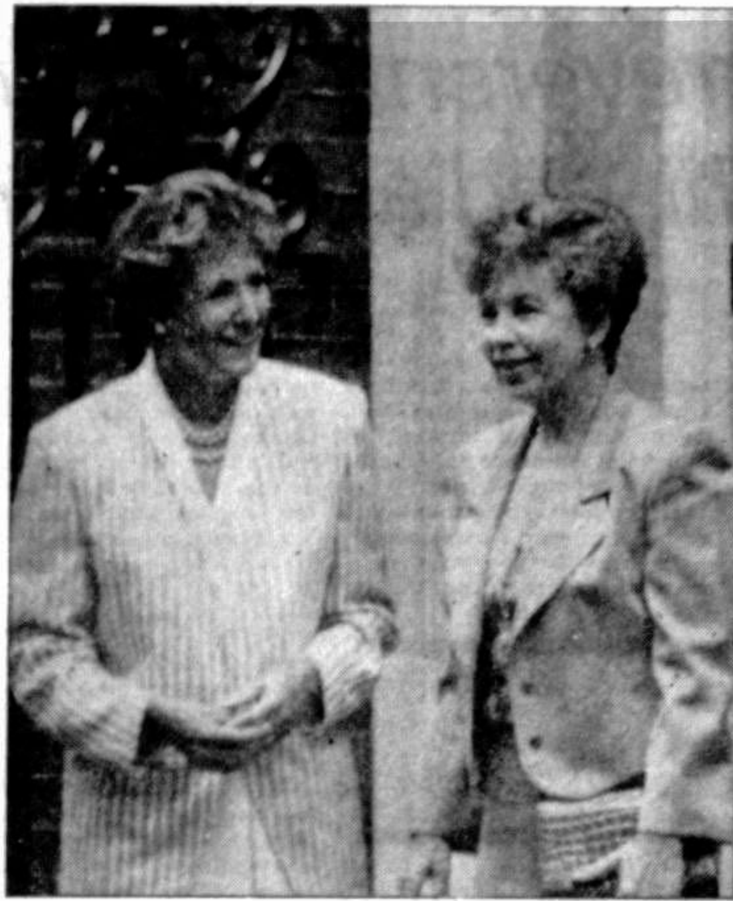
Norma Major, wife of the British Prime Minister John Major (L) welcomes her lunch guest Raisa Gorbachev, wife of the Soviet President Mikhail Gorbachev, outside 10 Downing Street on Thursday.

We shall write about the difficulties faced by the testing laboratory in one of our subsequent issues.