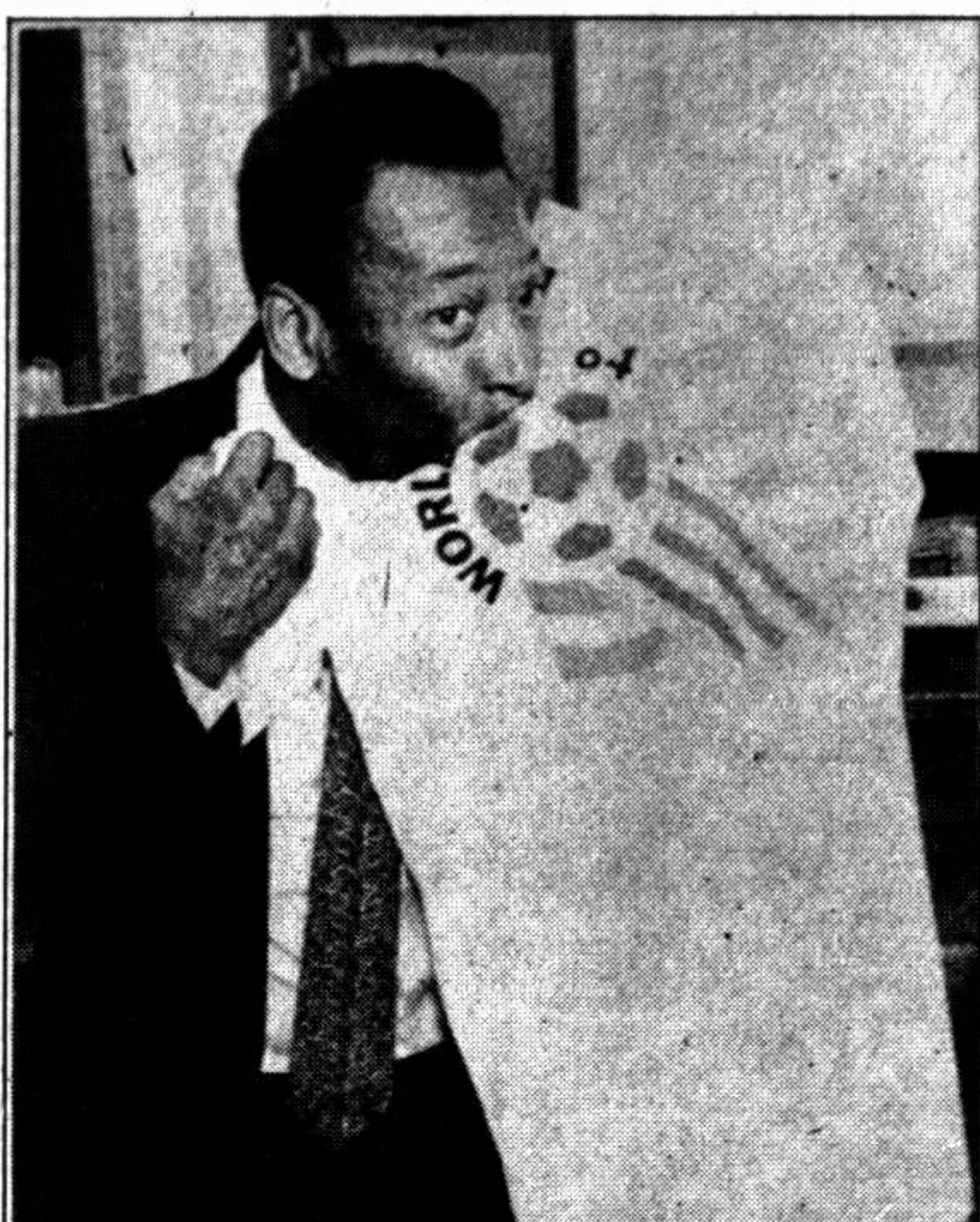
Brazilian soccer legend Pele kisses a World Cup '94 T-shirt before testifying to a US congressional sub-committee in support of legislation authorizing a commemorative coin for the 1994 World Cup Championships to be held in the US.