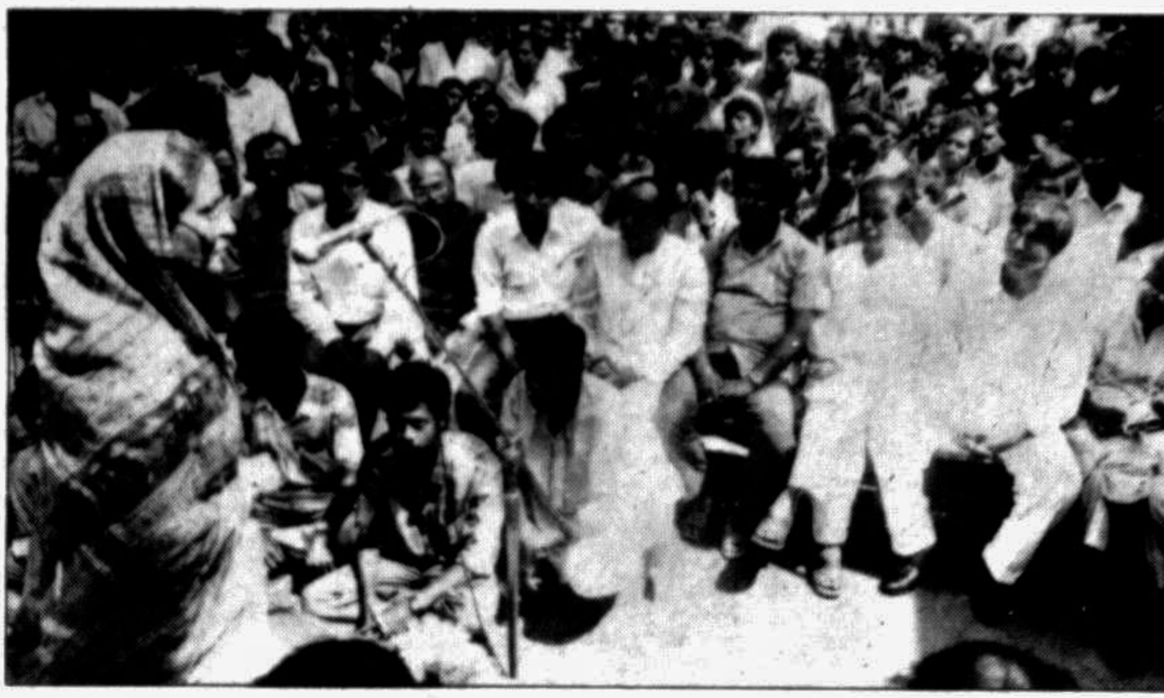
Sheikh Hasina addressing members of JSD (Inu)-backed Chhatra League (N-S) and Chhatra Union workers who joined the Chhatra League (S-A) at Bangabandhu Bhaban Wednesday.