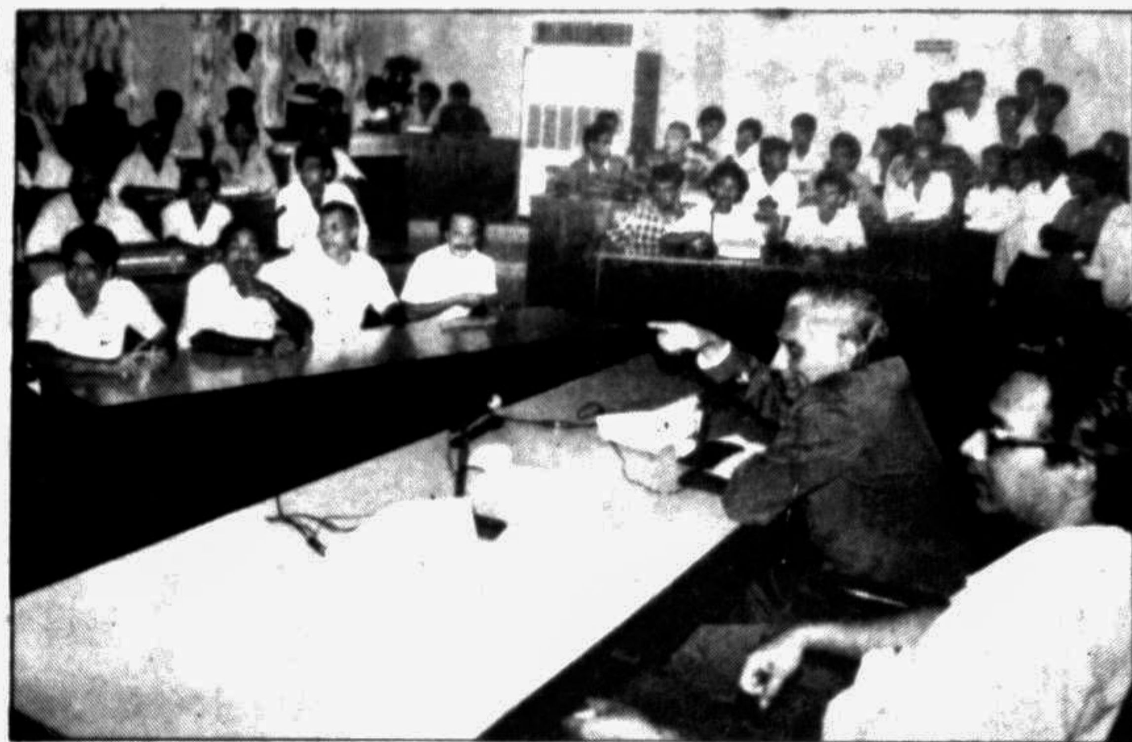
DU VC Maniruzzaman Miah exchanging views with teachers and students on session jam in Dhaka on Wednesday.