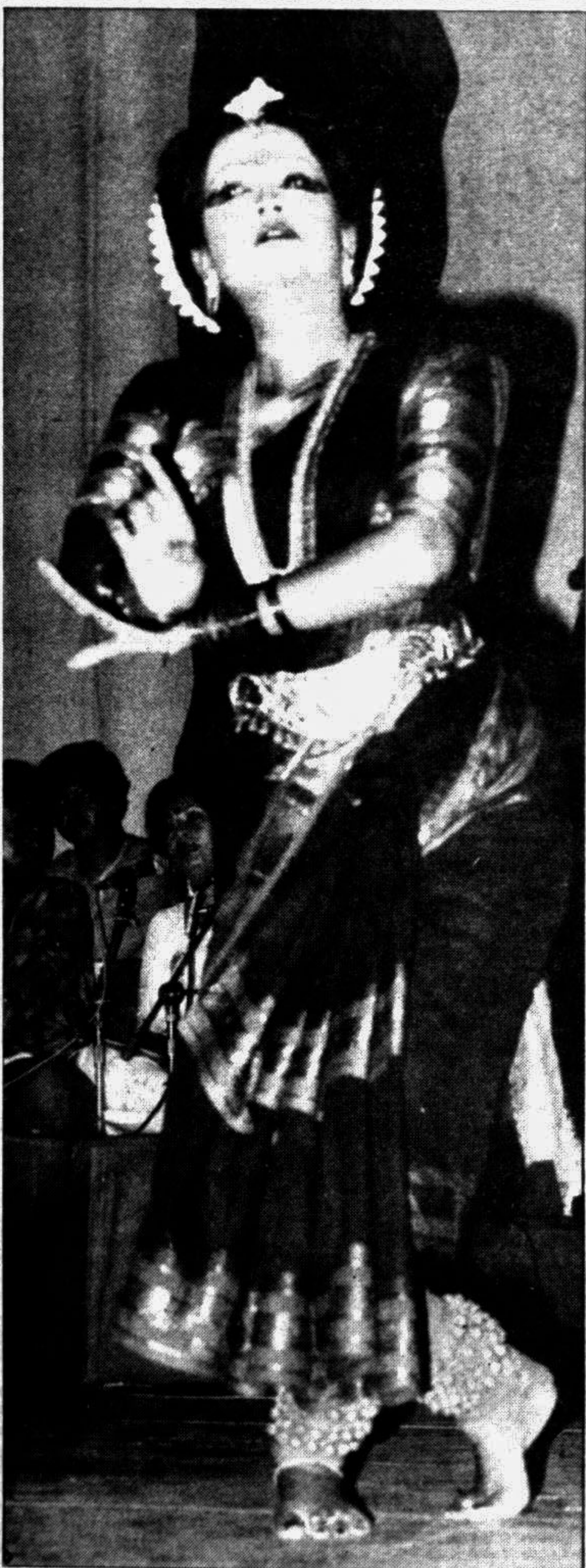
My heart dances like a peacock it dances ... .. Rabirag, a cultural organisation, celebrating advent of monsoon in the city yesterday.

Besides, the case of the former President of the Chhatra Union Mostafizur Rahman Babul against Ershad for illegally assuming power is also being considered by the Home Ministry.