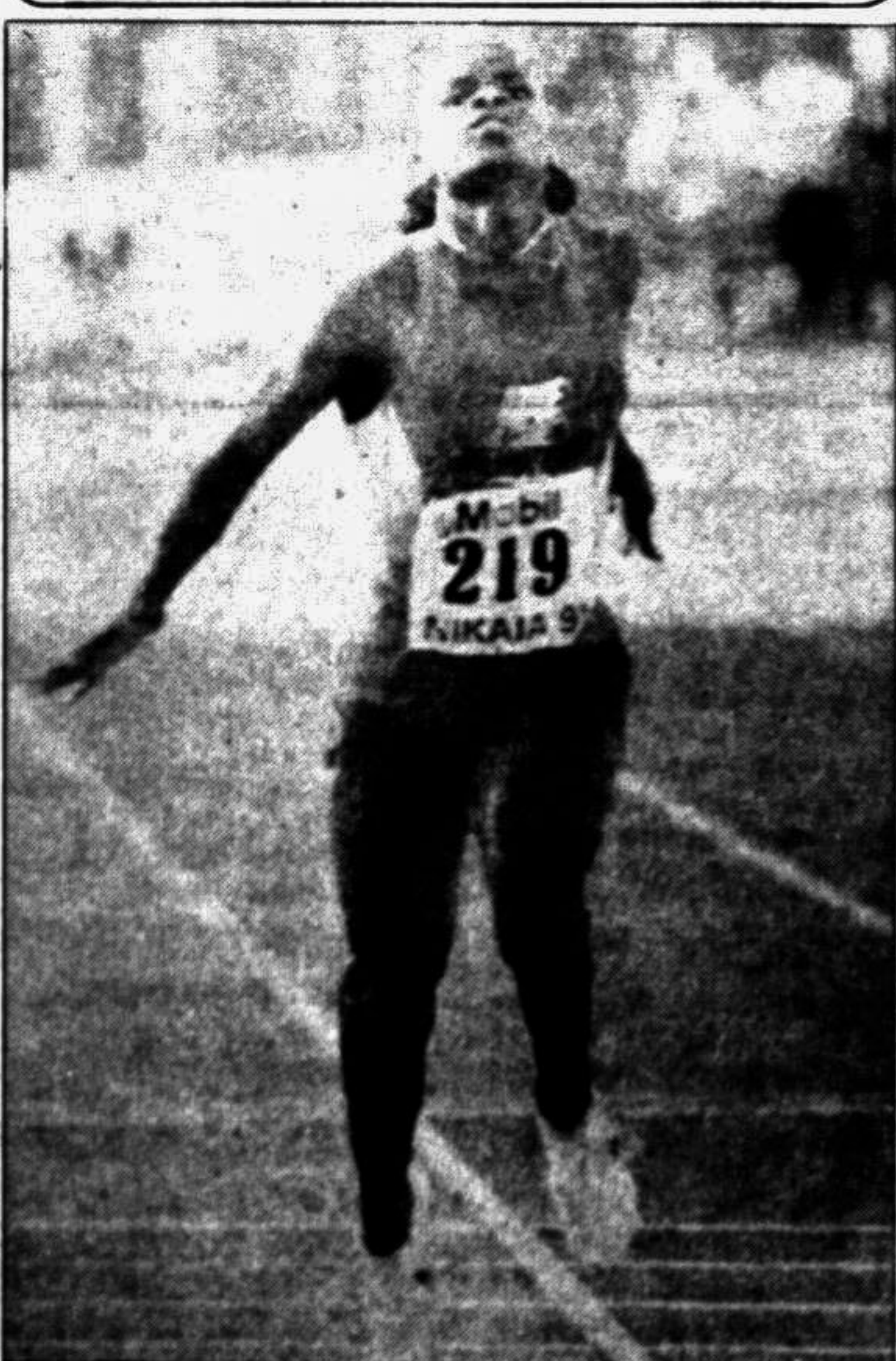
US sprinter Laurence Guidry crosses the finish line to win the women's 100 metres in 11.22 sec. at the international track and field 'Nikaia' meet held in Nice, France, July 15.

The International Cricket Council, the game's world authority, elected the non-racial UCBSA to full membership in recognition of political reforms and moves to desegregate the sport in South Africa.