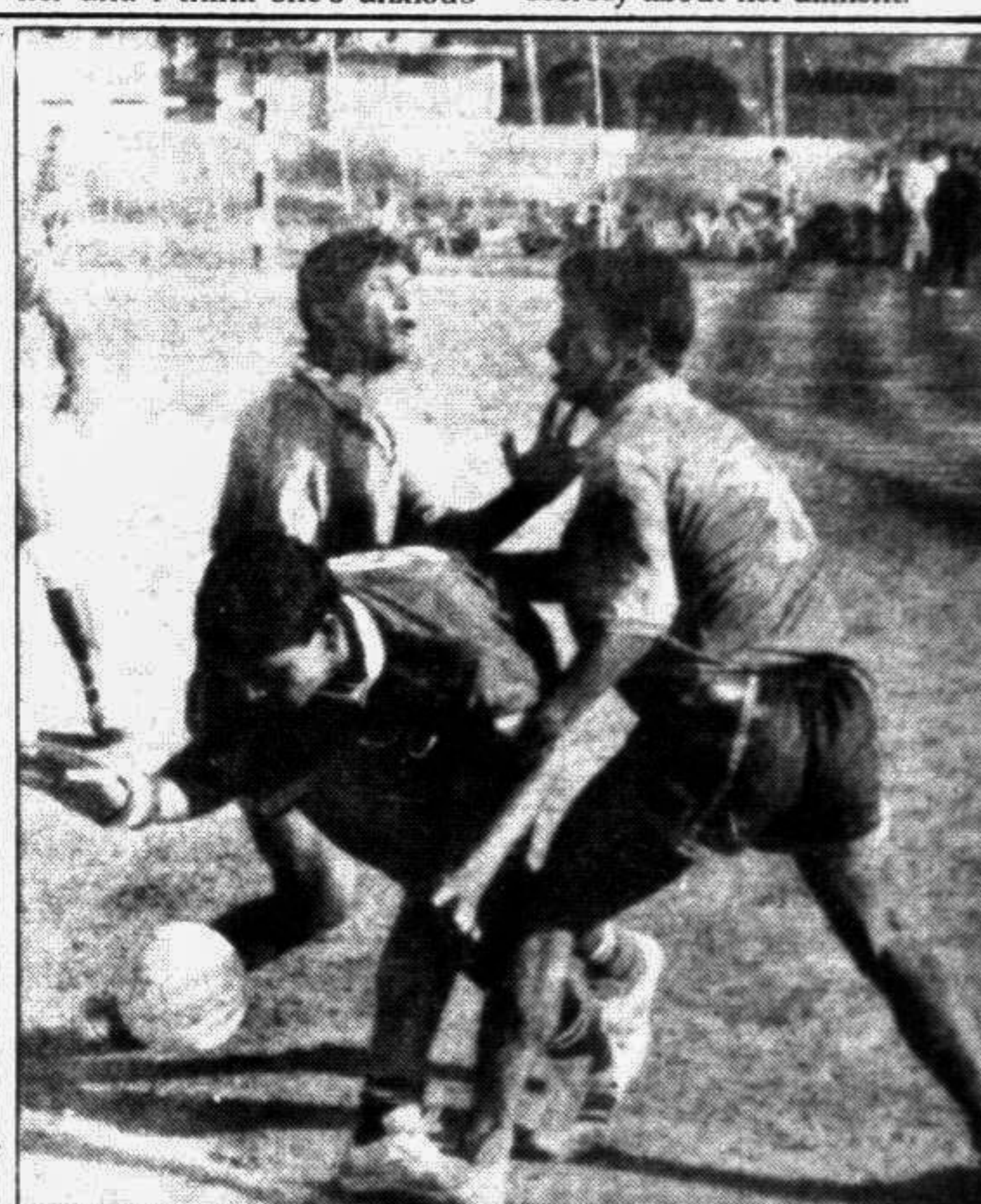
Bangladesh Police versus Sabuj Sangha Monsoon handball match in progress yesterday at Outer Stadium's handball court.