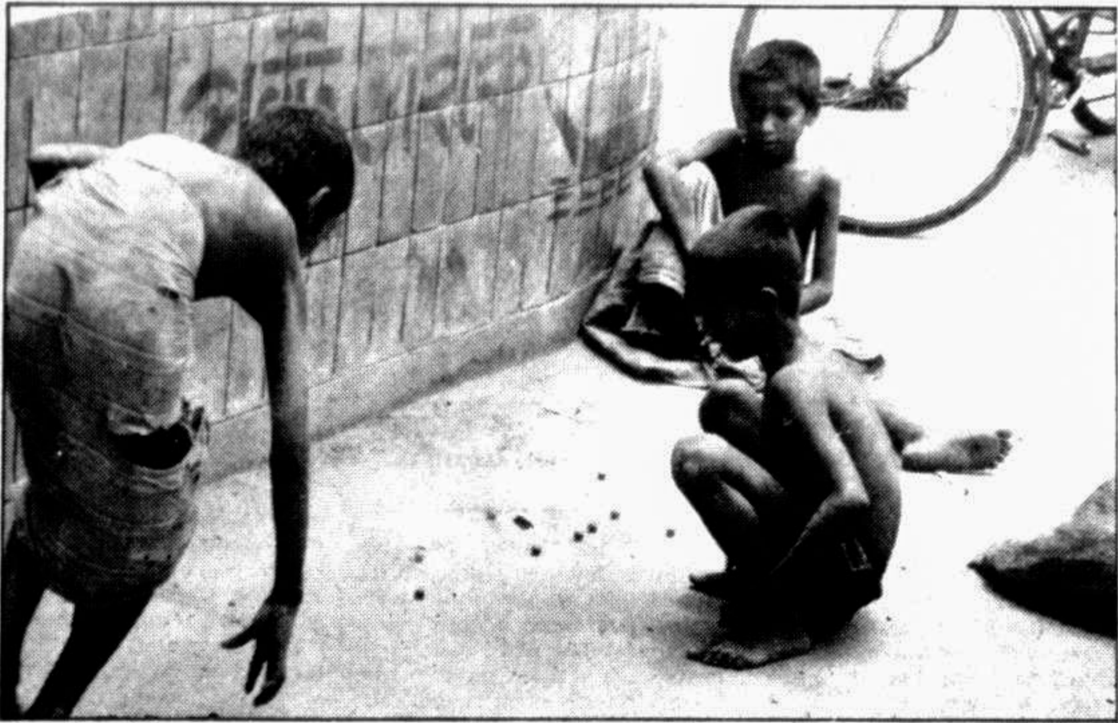
Only bit of fun they have.