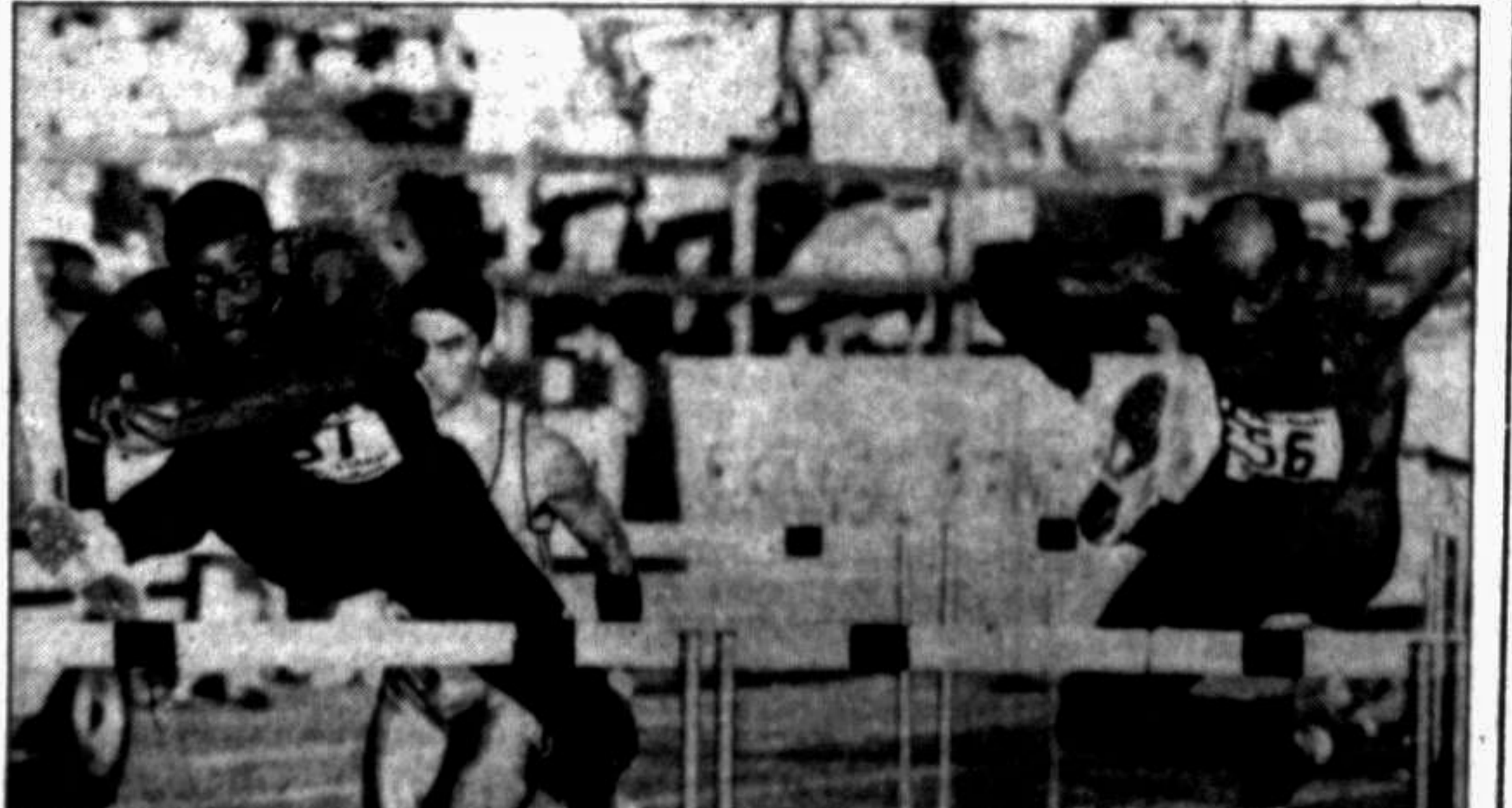
US Greg Foster (R) on his way to win the 110 metres hurdles at Happeerranta eastern Finland, on July 9 in 13.11 seconds, the best time in the world this year. His compatriot Tor Dees (L) was placed second in 13.35 seconds.