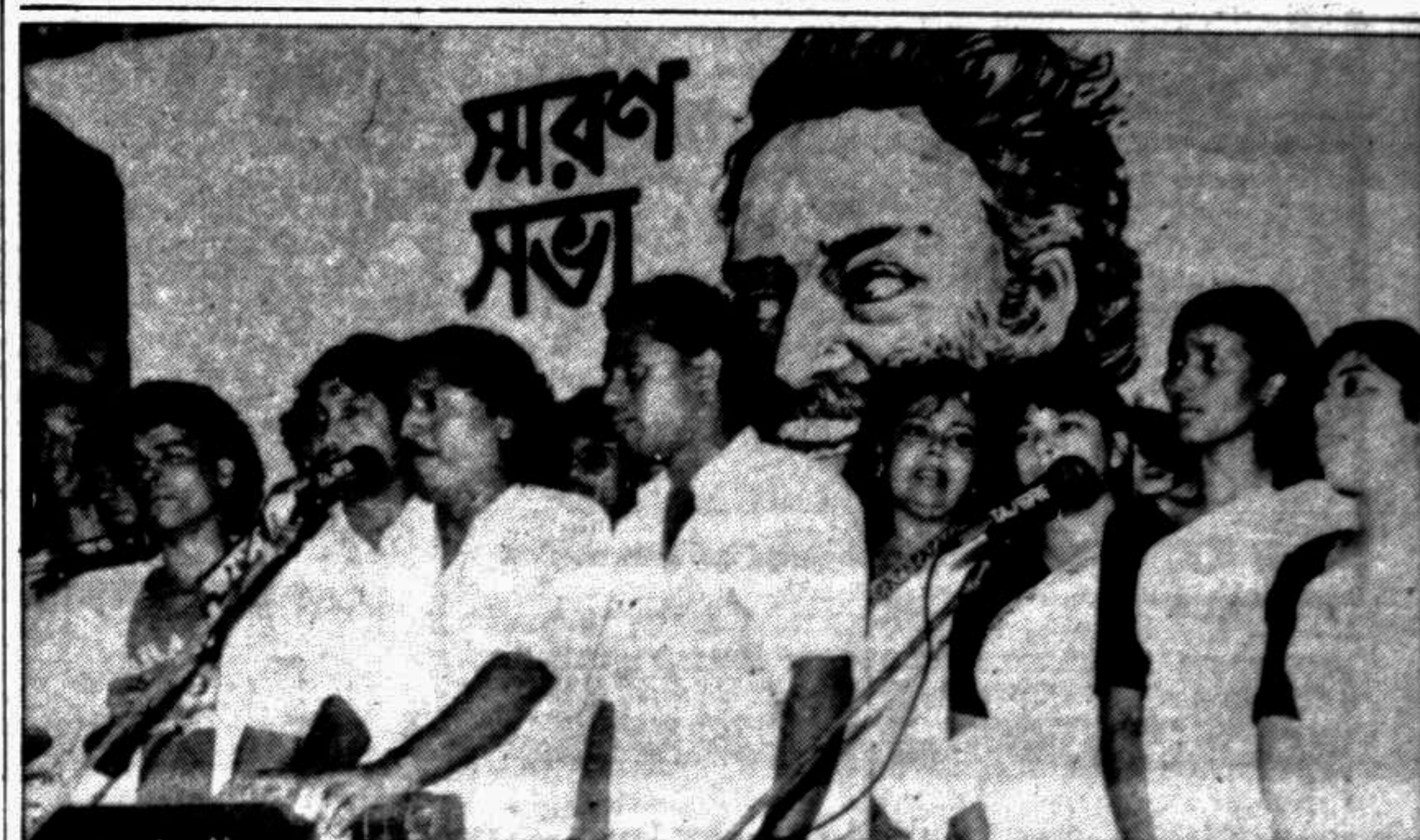
Members of Rishiz Shilpi Gosthi seen rendering songs in memory of writer Rudra Mohammad Shahidullah in front of National Press Club on Wednesday.

ADB will provide about 68 million dollars for development of primary education in Chittagong division, the meeting was informed, says an official handout.