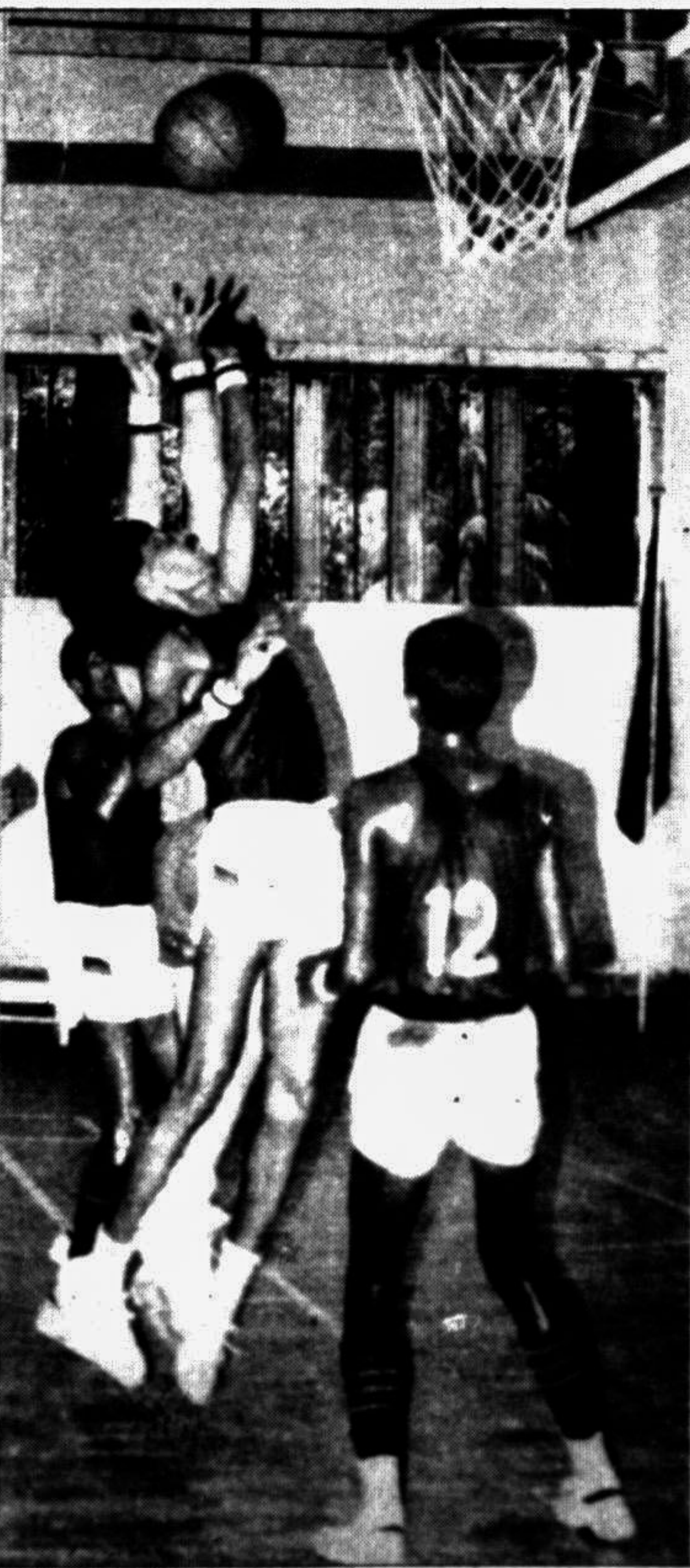
Yesterday's BGIC Cup basketball match between Khulna DSA and Bangladesh Ansars in progress at the wooden-floor gymnasium. Ansars won 45-38.

Earlier, Savar Area team defeated the Log Area team by a solitary goal on Monday while the other match of the day between the Chittagong Area team and the Anti-aircraft Artillery team ended goalless.