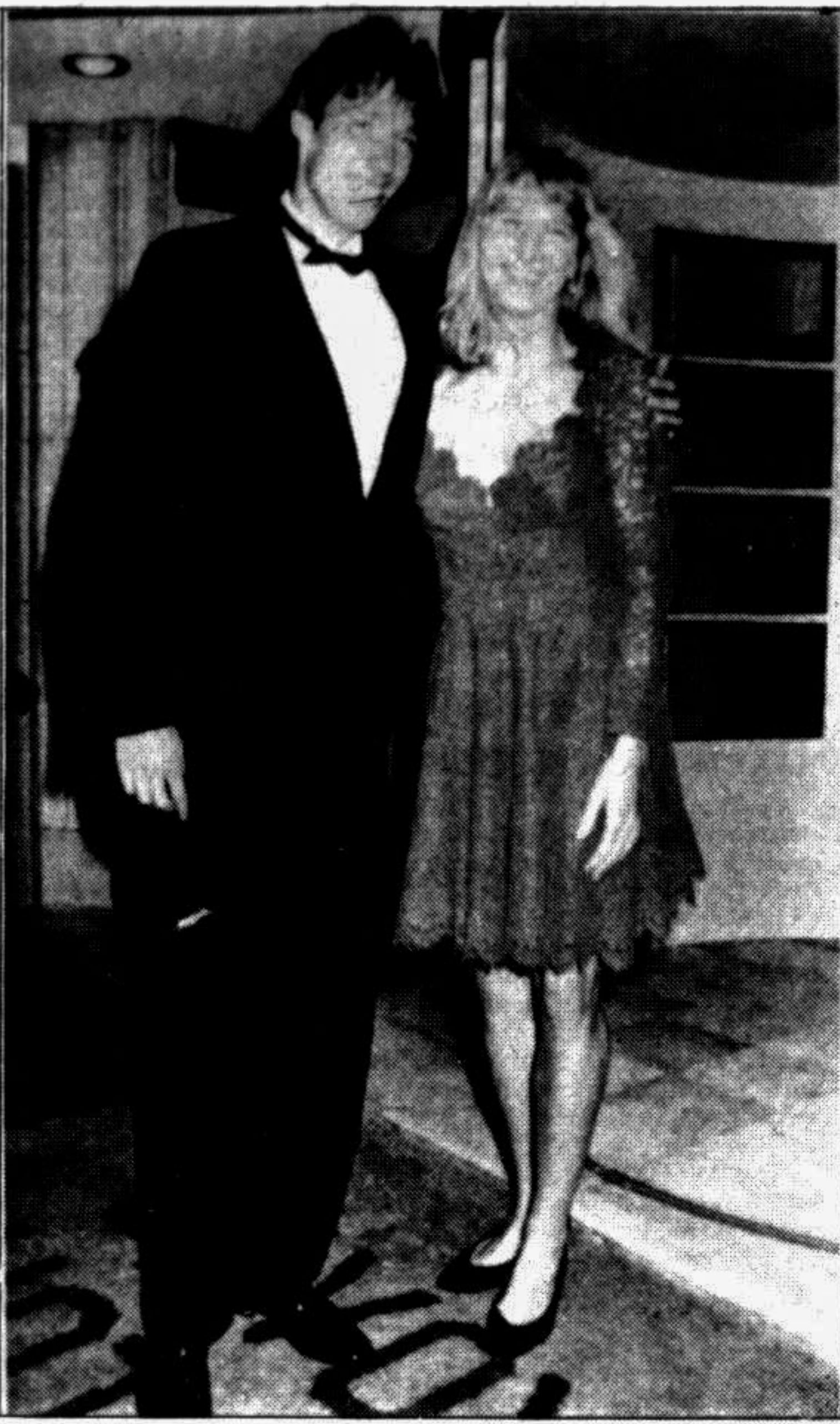
Wimbledon champions Michael Stich (L) and Steffi Graf of Germany pose during the traditional Wimbledon Ball at Sevoy Hotel, London, on July 7.

The West Bengal Sports Minister, Mr. Subhash Chakraborty, handed over the materials to Deputy High Commissioner of Bangladesh in Calcutta Mr. Mahbubul Alam.